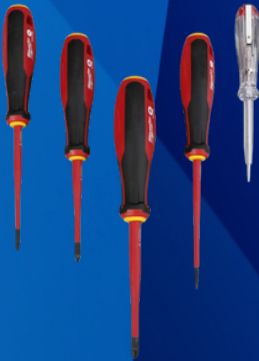
5 PIECE TRI-LOBE VDE SCREWDRIVER SET