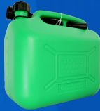
PETROL CAN 5L