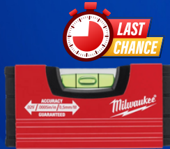
MINIBOX POCKET LEVEL 10CM