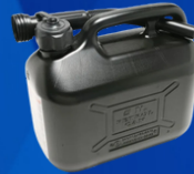
DIESEL CAN 5L