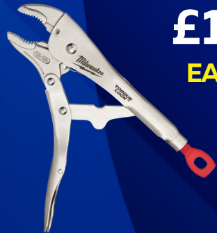
10" TORQUE LOCK CURVED OR STRAIGHT JAW LOCKING PLIERS