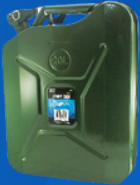
JERRY CAN 20L