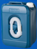
AD BLUE 10 LITRES