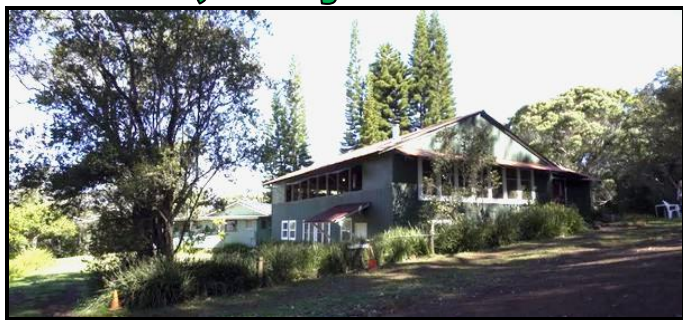
Hale Koa Campgrounds, Kokee State Park (Adjacent to Waimea Canyon)