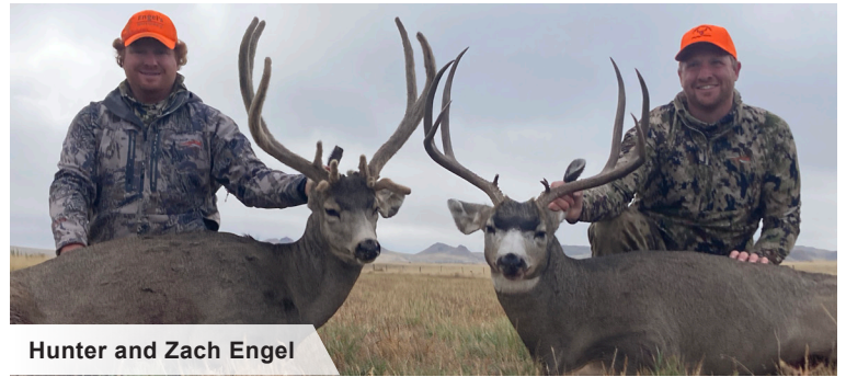
Hunter and Zach Engel

Two deer down and very proud hunters. The rest of the day was spent looking for Dave's deer. Not one filled the criteria. Day three was again looking and looking. Time is not their friend. They are not finding what they are looking for. Time is running out. They found a very impressive 3x4 way off on the other side of a ravine. Not much time left, and he is hidden behind a tree at 400 yards. They needed a lot to happen in a short amount of time. Using the same gun that Zach and Hunter used, Dave set up on a tripod and waited ever so patiently for the deer to do what he needed him to do. Guess what he did, the buck came out and Dave placed a perfect shot that rolled the deer on top of a juniper bush. WHAT A SHOT!! With 10 minutes of shooting light left. P Cross Bar had three incredibly happy and satisfied hunters. What a week.