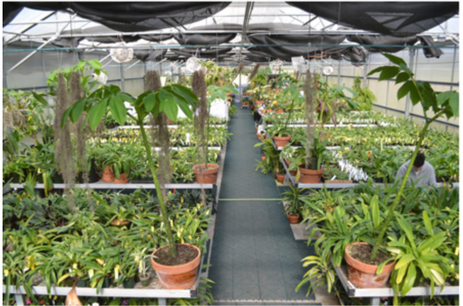
The orchid greenhouse.

The Huntington https://www.huntington.org consists of a library, art museum and botanical gardens. It is a collections-based research and educational institution located in San Marino, California. It was founded by Henry and Arabella Huntington and covers 120 acres. Henry was a railroad and real estate businessman. The gardens include a desert, bonsai and Asian gardens.