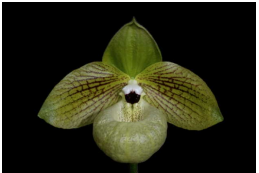
Exhibitor: Charles and Susan Wilson

Paphiopedilum malipoense S.C. Chen & Tsi 1984 is from mountainous cloud forests in southern China and Vietnam. It grows in leaf litter on limestone rocks in mostly deciduous forests and are usually east facing. It grows at elevations of 450 to 1450 meters and is warm to cool growing in these regions. It blooms in the spring and usually has 1 flower on its inflorescence. It is one of the largest Paphiopedilums especially its leaves. Flower inflorescences can exceed 75 cm with flowers up to 13 cm across. It has an apple-raspberry scent. It likes water more than most other paphiopedilums. It appears to be sensitive to air pollution. The Chinese botanist Feng first collected plants in 1947 but no published description was made until 1984.