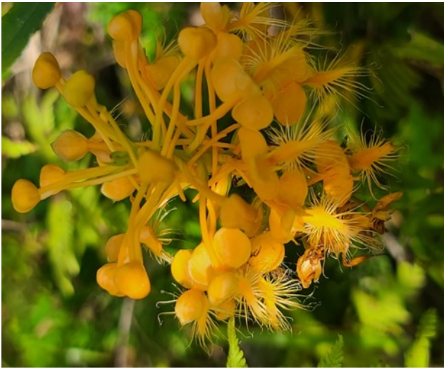
Yellow Fringed Orchid ( Plantanthera ciliaris )