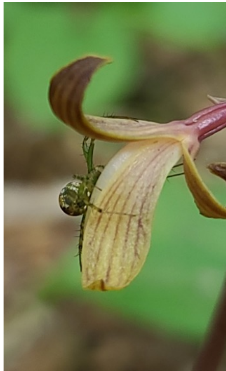
Spider on Coral-root