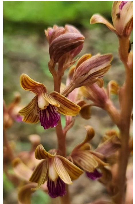
Crested Coral-root ( Bletia spicata )