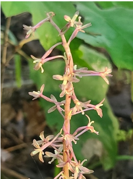
Crane-fly Orchid ( Tipularia discolor )