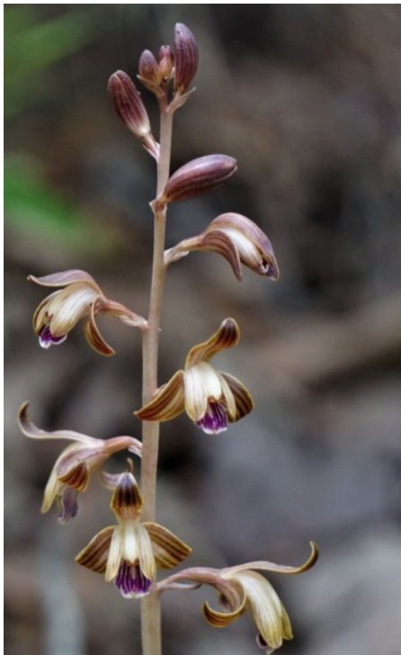
Crested Coral-root ( Bletia spicata )