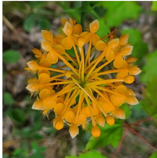
Top view of ciliaris