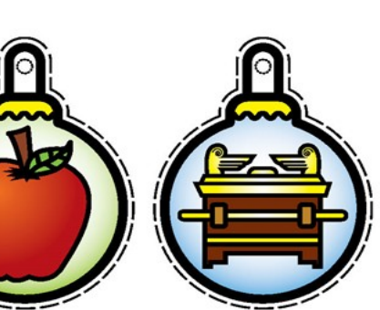
Apple The apple reminds us of the forbidden fruit that Adam and Eve ate in the Garden of Eden.