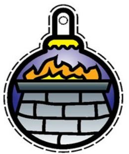
Altar of Holocaust The Altar of Holocaust is where Moses made a sacrifice of burnt offerings to God.

These 19 Jesse Tree symbols represent key biblical figures and events leading up to the birth of Jesus. The symbols can be cut out and hung on a branch or tree, or used as two-dimensional ornaments pasted on a large tree drawing. The symbols were created by local graphic designer Lawton Mak.