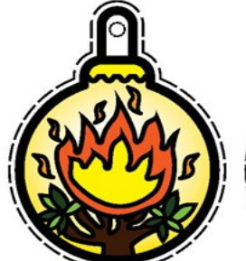
Burning Bush God revealed himself to Moses through a burning bush.