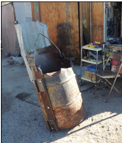
Ore bucket at the Reserve Bank Mine