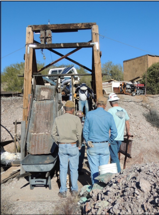
Four fit and brave men await their descent into the depths of the Reserve Bank Mine.

.....Reserve Bank Mine continued from page 6