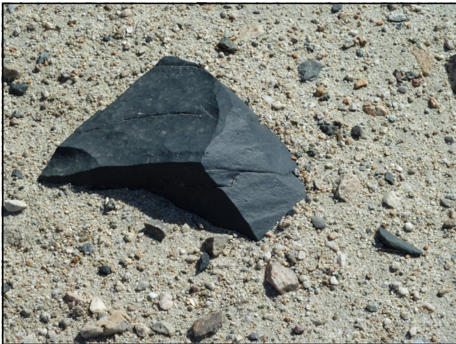
FIGURE 5 Ventifact This is a photo of a ventifact in Death Valley. Note that there are at least 3 major facets, and 3 minor ones — reflecting prevailing and changing wind directions. The rock is faceted, smoothed, and polished.

Ventifacts Ventifacts are rocks that are faceted by the abrasion of sand, blasted by wind (Figure 5). We haven't seen any on recent club field trips, but we may — or you may encounter them on your personal forays into the desert. Rocks may exhibit 1 or more flat faces, reflecting the wind direction(s) impacting them. Additionally, rocks may be fluted or otherwise sculpted by prolonged sandblasting.