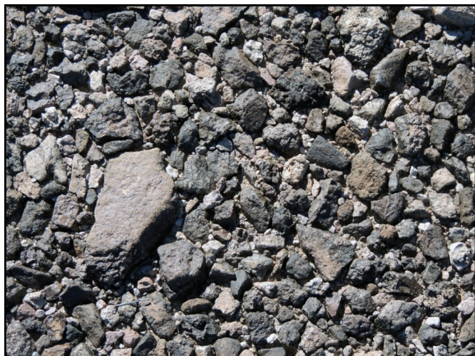
FIGURE 2 Desert Pavement In the photo above, from the Brenda area, you see a surface covered with interlocking rocks. Below, is the same surface disturbed, to show the fine material that exists below the rocky surface.

Desert Pavement Desert pavement (Figure 2) is a protective armor of interlocking pebbles and cobbles, that covers the desert floor. This surface has largely been considered a lag deposit — rocks left behind as wind and water winnow away the small sand, silt and dust. An additional factor that has been favored is also heaving. With heaving, clays that swell when wet, push rocks toward the surface, and smaller particles fall under the rocks to fill in the gap (and thus keep the rock at the higher elevation). Over time, the rocks are lifted to the surface. (This process may also occur as salt crystals form in a soil. Expansion with crystallization can lift soil particles.) More recently, it has been proposed, that in addition to heave, dust particles somehow are deposited under the rocks, thus building up a rockless soil below the desert pavement.