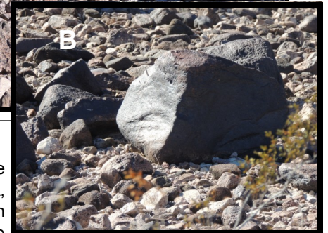
FIGURE 1 Desert Varnish

These photos are from the Brenda trip. In the Image A, you see various rocks with very dark surfaces. The rock, in the center, has been chipped, revealing the lighter-colored rock beneath the thin black coating. The rock in Image B illustrates the shiny surface, as it catches the sunlight.