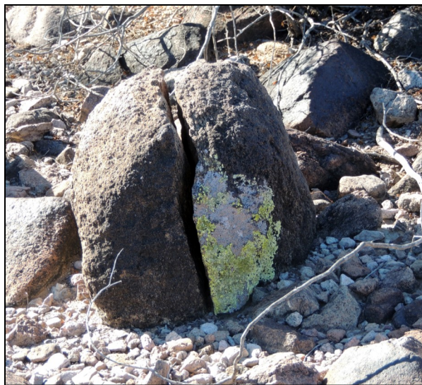
FIGURE 3 Boulder Cleavage A boulder that has cracked due to thermal expansion and contraction on the desert floor near Brenda, Arizona.

Boulder Cleaving Many rocks in desert pavement are cracked (Figure 3). This is thought to be primarily precipitated by thermal expansion and contraction, due to solar heating and subsequent cooling (cooling especially during the morning hours). Other processes that may contribute to the development and expansion of cracks are salt crystal growth, clay expansion, and gravity.