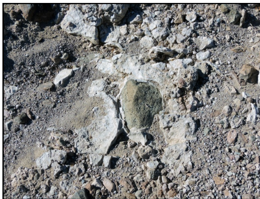
FIGURE 4 Caliche Caliche binding cobbles together on the desert floor near Brenda, Arizona.

Caliche Caliche is a deposit of calcium carbonate, that acts as a cement between rocks and other soil particles (Figure 4). It occurs at or near the surface of desert soils — in areas where this soluble material is not washed out. It can be recognized as a usually very light-colored material, in which you may be able to see thin layers; and of course it will fizz in acid.