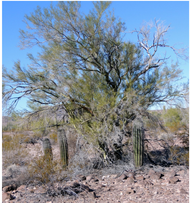
FIGURE 7 Nurse Tree Three young saguaros huddle under the protective branches of a palo verde tree, near Brenda, Arizona.

Nurse Tree Throughout the desert you may see saguaros growing under the protective boughs of a palo verde, ironwood, or mesquite tree. This is a nurse tree (Figure 7), and it does provide protection from sun, frost, and possibly some wildlife. This relationship is good for the saguaro, but may prove fatal for the tree, as the cactus competes for water and nourishment.