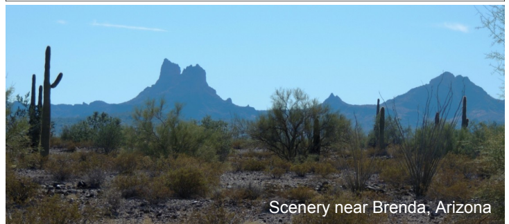
Scenery near Brenda, Arizona

These photos are from the Brenda trip. In the Image A, you see various rocks with very dark surfaces. The rock, in the center, has been chipped, revealing the lighter-colored rock beneath the thin black coating. The rock in Image B illustrates the shiny surface, as it catches the sunlight.