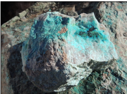
Chalcocite (dark mineral) surrounded by chrysocolla. Both are copper minerals, but chalcocite (copper oxide) can be successfully smelted for free copper.