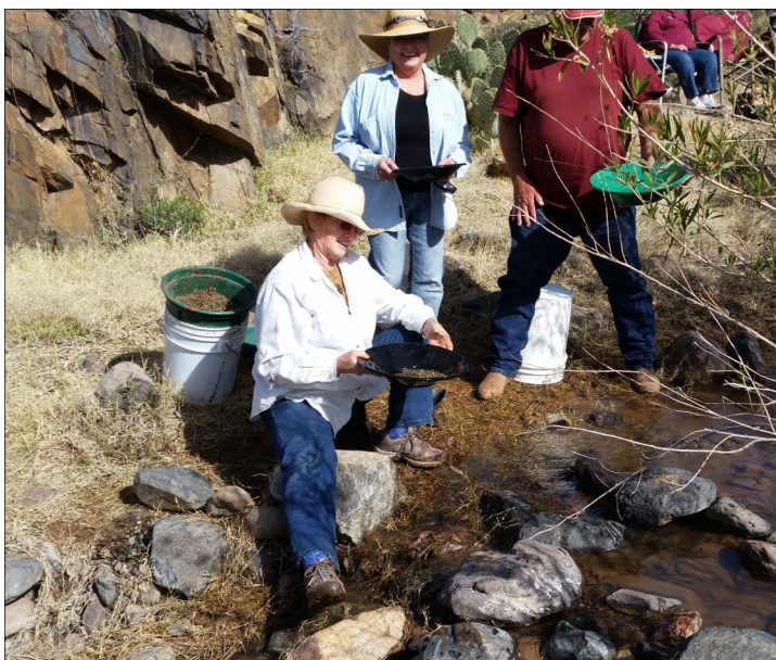
Panning and sluicing on the club claim during the field trip and potluck on January 28th.