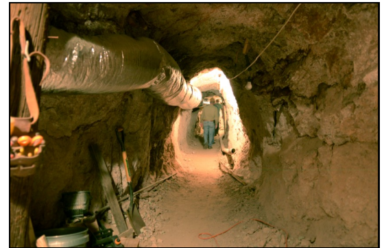
Adit within the Reserve Bank Mine