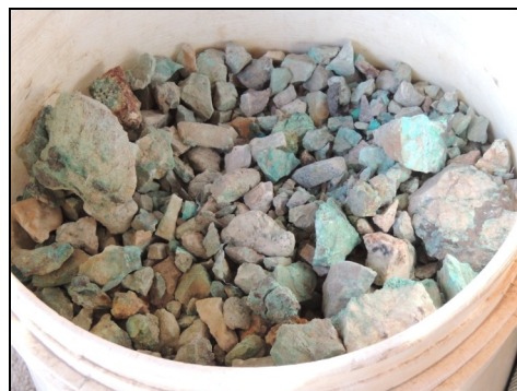
Crushed high-grade ore, Reserve Bank Mine