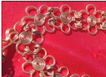
Beautiful necklace of bent AZ copper wire, made by Joyce Ramage