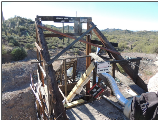
Headframe of the Reserve Bank Mine.