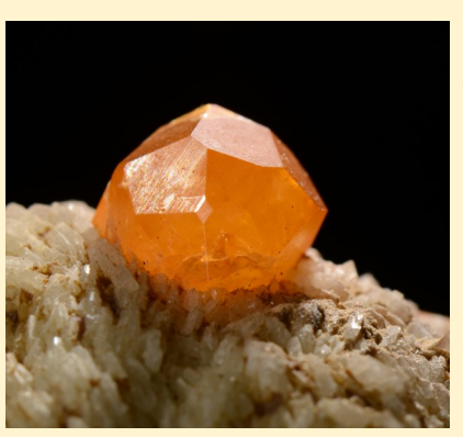
SPESSARTINE on ALBITE Pedra Bonita Mine, Carnauba dos Dantas, Rio Grande do Norte, Brazil