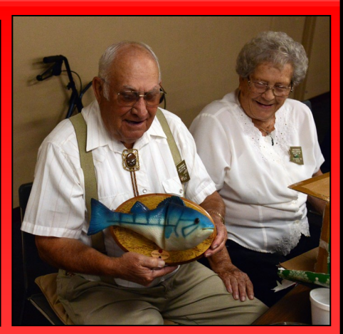
It's a classic!