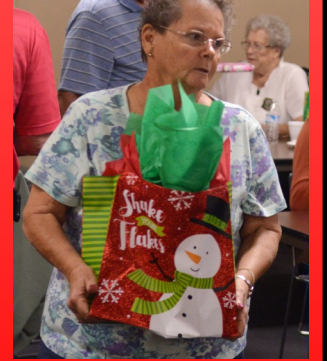
So does this one.