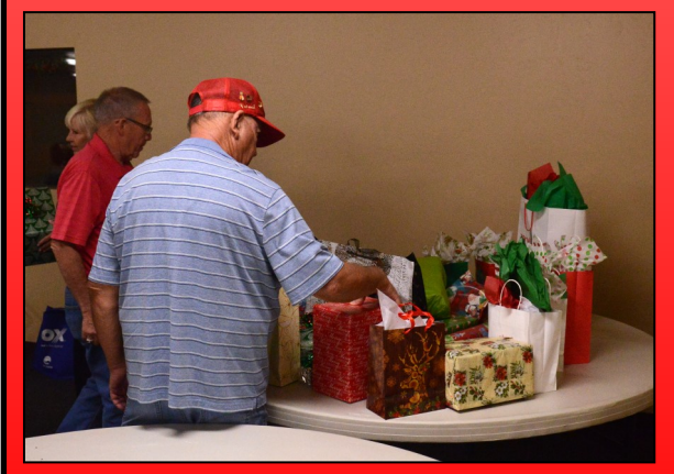
Which one, which one, which one? So many choices!