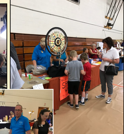
attendees browsing and buying