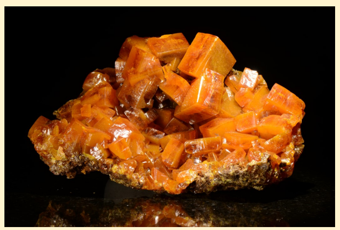
WULFENITE Los Lamentos, Chihuahua, Mexico