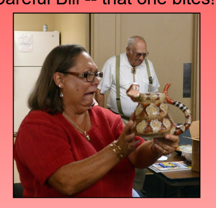
And it is the white elephant. Will we see it again next year?