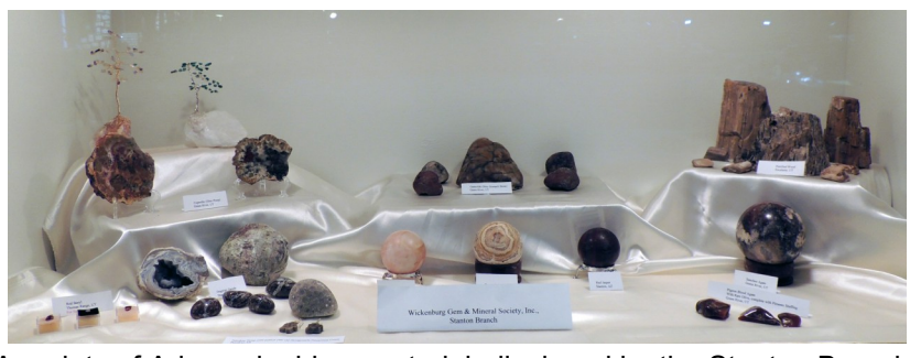
A variety of Arizona lapidary material, displayed by the Stanton Branch.