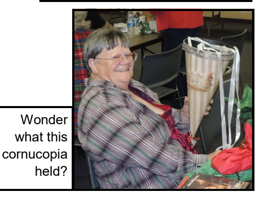
Gift exchange coordinator gets to satisfy her sweet tooth.