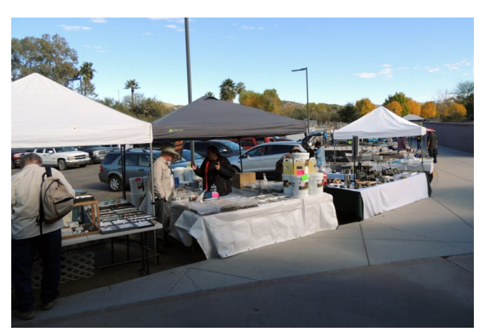
Outside dealers at the 2014 WGMS Gem & Mineral Show