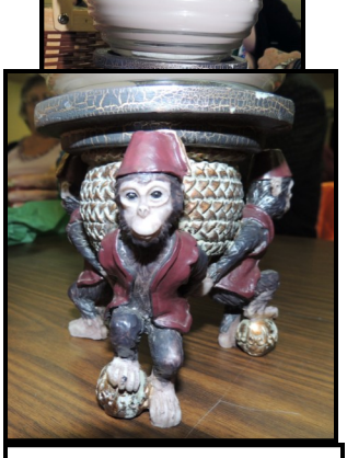
Bet we see this next year!