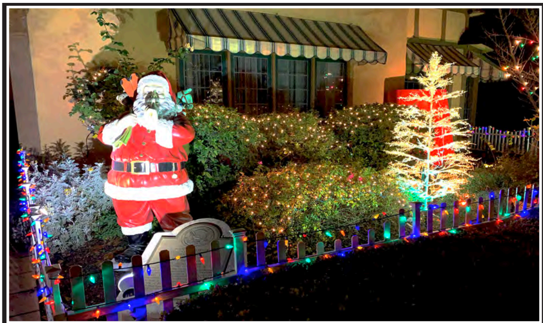
Santa is caught decorating the front of the Ainsley House.