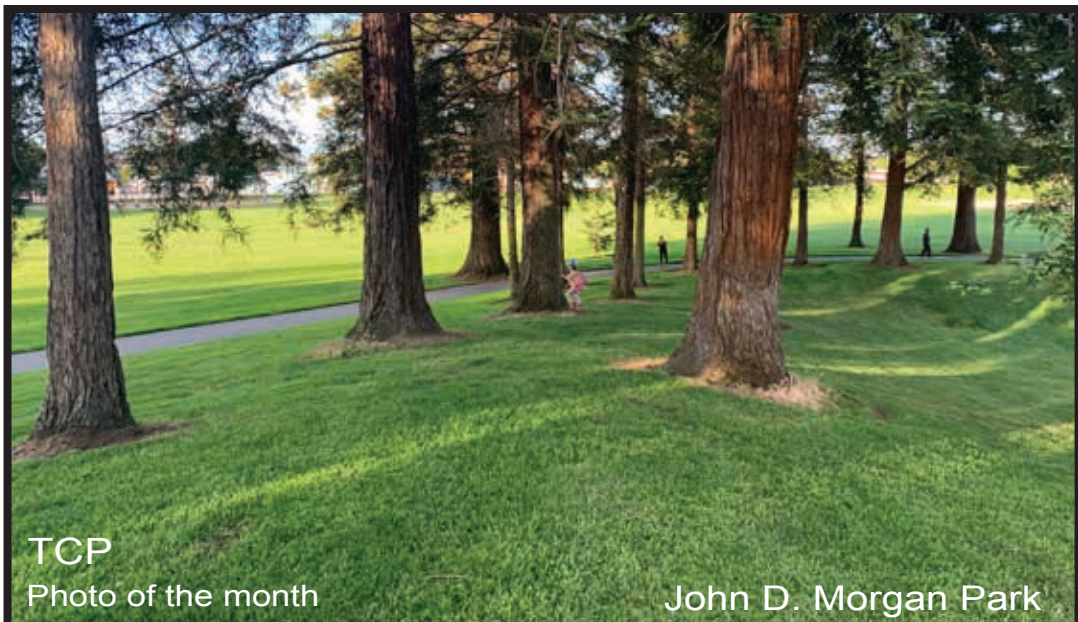
TCP Photo of the month

Orchard City Banquet Hall 1 W. Campbell Ave Campbell 408-779-4914 Sunday Service: 10:00 am www.community-christian.us