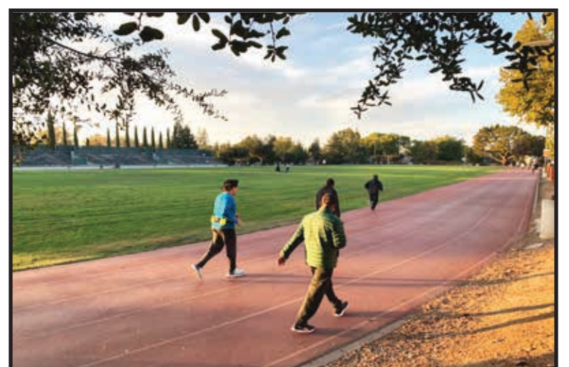
WE'LL GO ROUND IN CIRCLES: The Community Center track has long been a popular destination for exercise and never showed any signs of slowing during the Pandemic.

This will be hosted and narrated by Jonny Moseley! Some of the proceeds from the tickets will go to the Heritage Theatre.