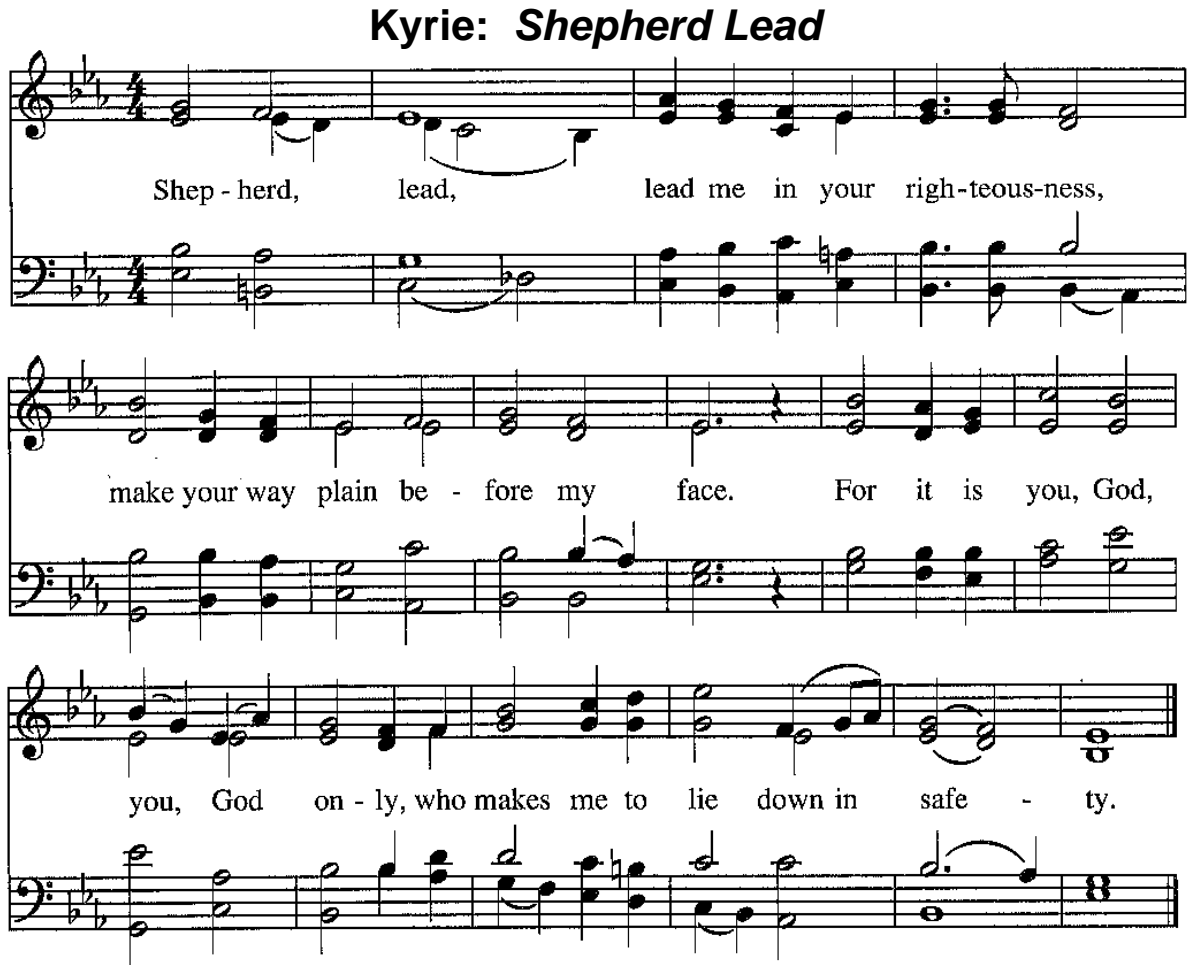
Reprinted under OneLicense.net #A-715560 New Century Hymnal