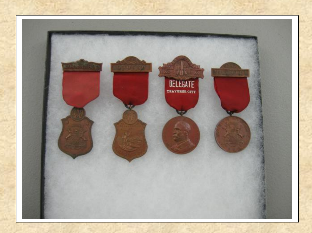
Michigan Department Delegate Badges