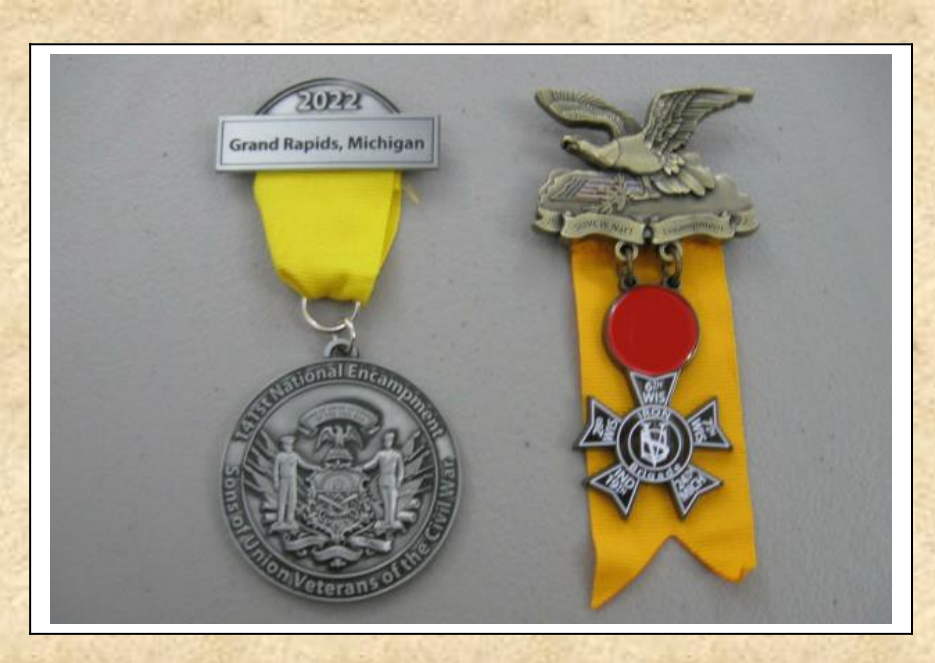
SUVCW 2022 National Encampment Badges