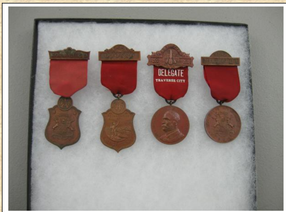
Michigan Department Delegate Badges