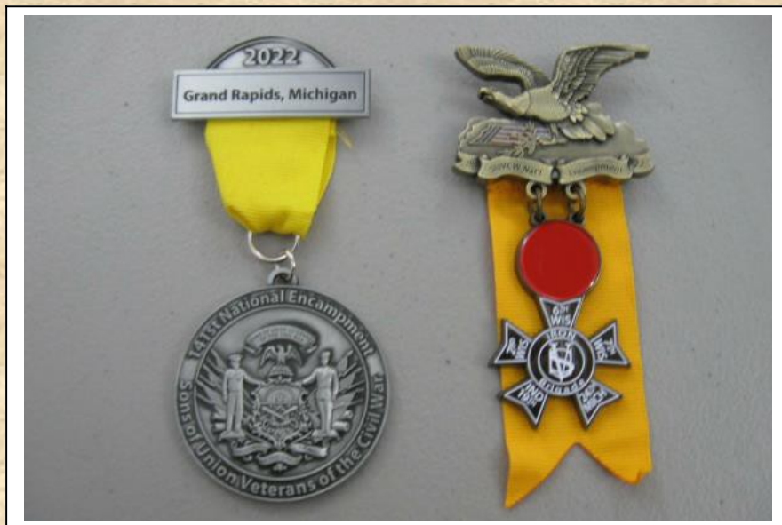
SUVCW 2022 National Encampment Badges