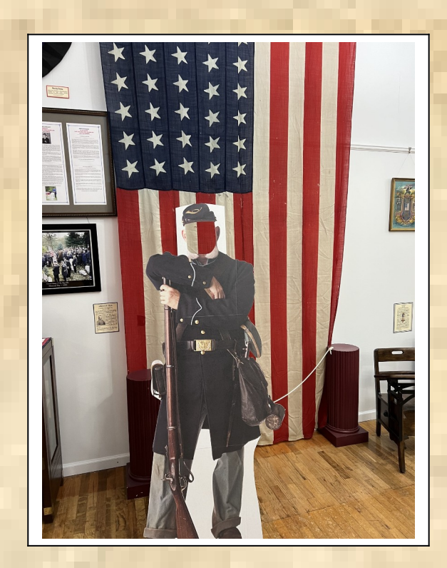
Cardboard Civil War Soldier for photos of visitors