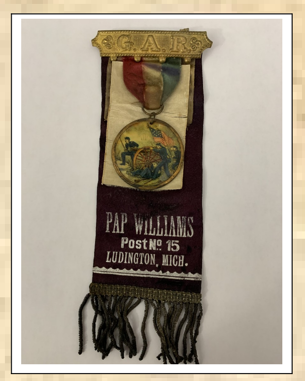
Memorial Ribbon – Ludington, MI Post