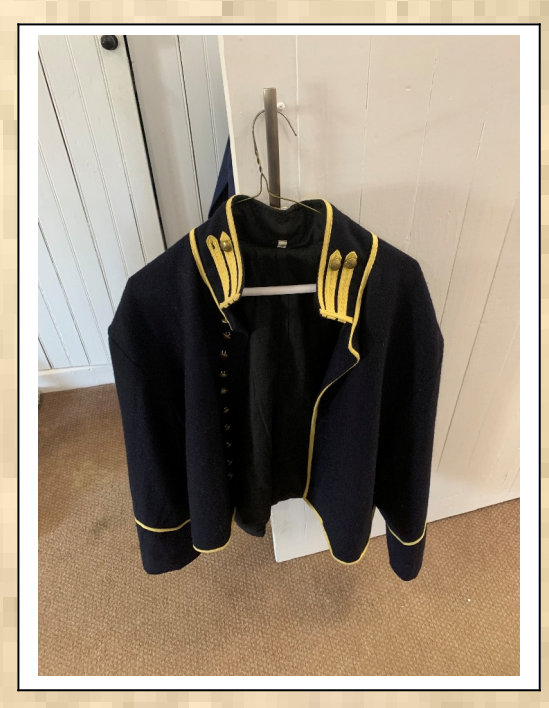
Reproduction Civil War Cavalry shell jacket