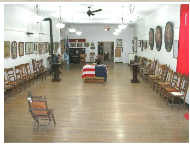
Second Floor, 10 years ago