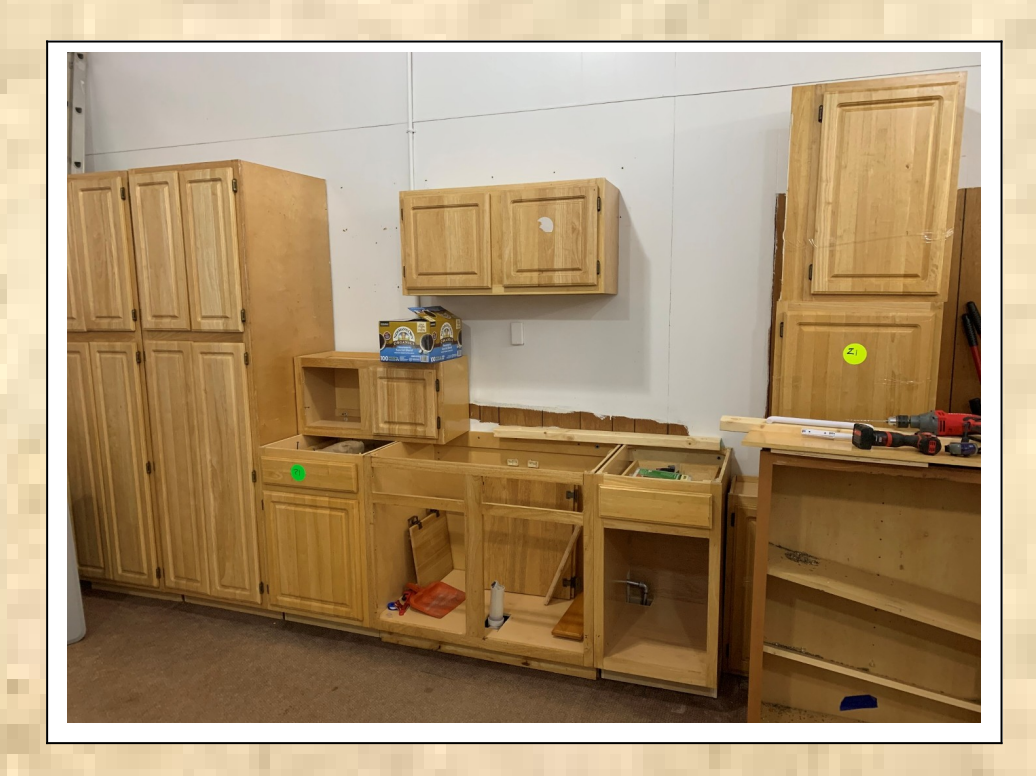
Remodeling our first floor storage room

Two Women's Relief Corp badges. National President on the left, Director of the Juniors on the right