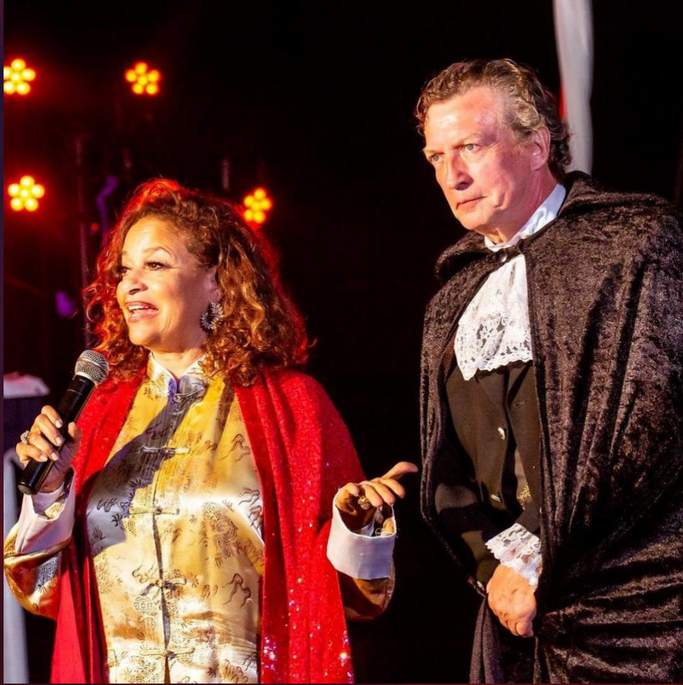
Debbie Allen and Nigel Lythgoe at Luminario Ballet's Masquerade Gala, Jonathan Beach Club, 2018