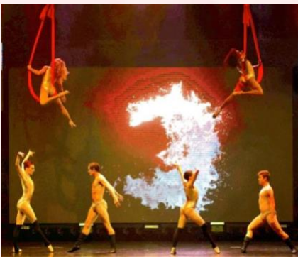
"Hard As a Rock"