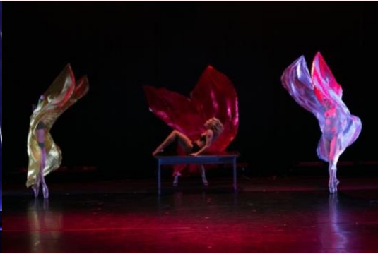
"The Last Supper"