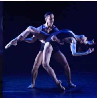
"If the Walls Could Scream"