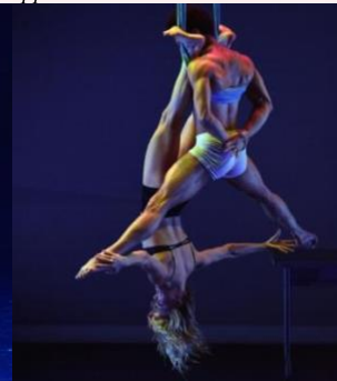
"The Last Supper"