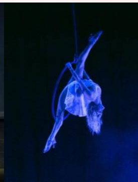
"The Last Supper"