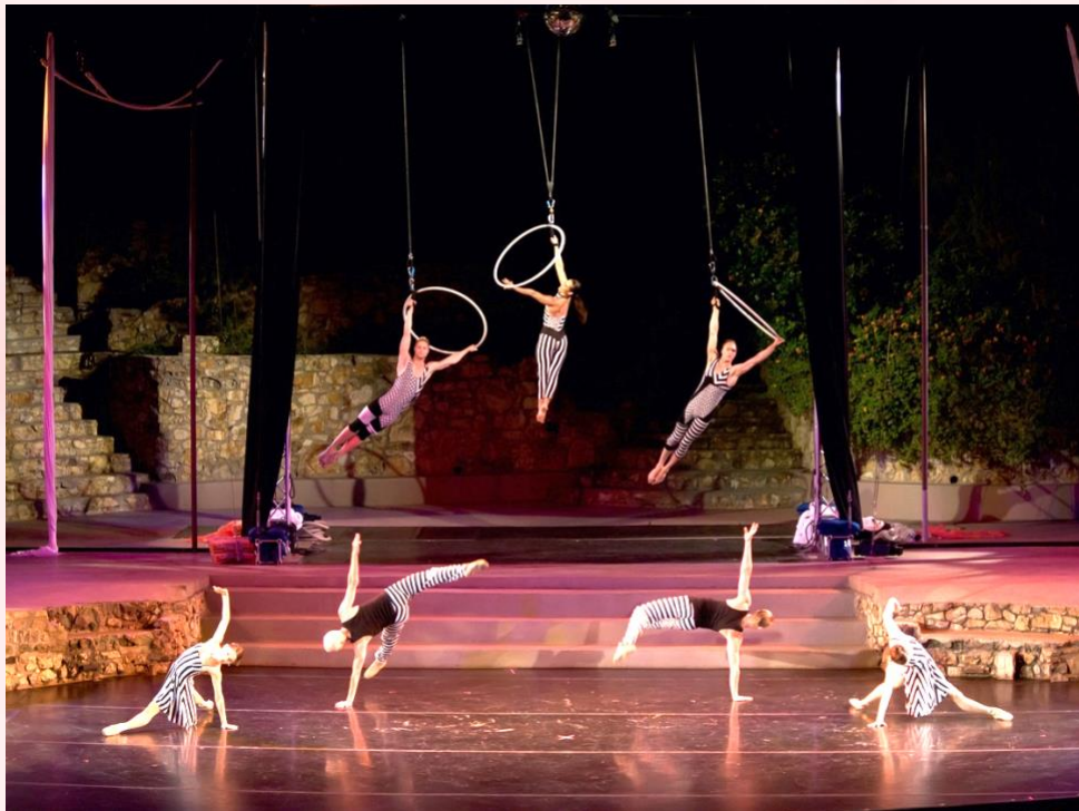
“LedZAerial -Ramble On” Ford Amphitheatre, Hollywood, CA

Should your venue require either a union waiver or city/state waiver for our rigger to access, please complete any applications/requirements in advance of our arrival so our rigger has full access to the theater/venue grid.