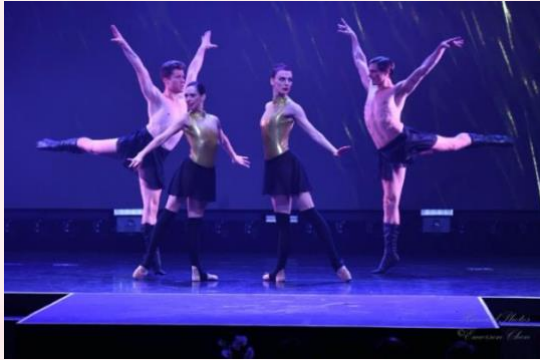
"Hard As A Rock"