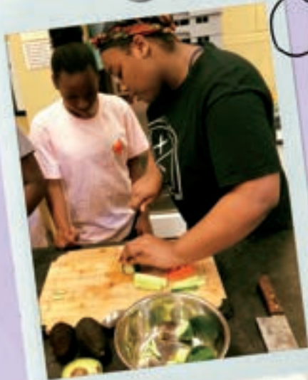
Healthy Cooking Workshops July 2011