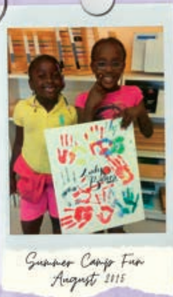
Summer Camp Fun August 2015