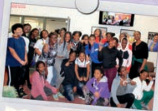
Volunteering at a local Food Bank March 2011