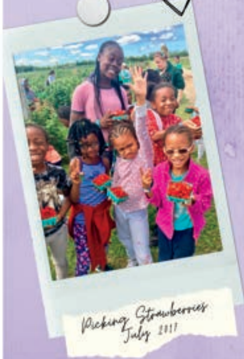
Picking Strawberries July 2011