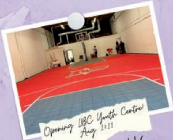
Opening LBC Youth Centre Aug 2021