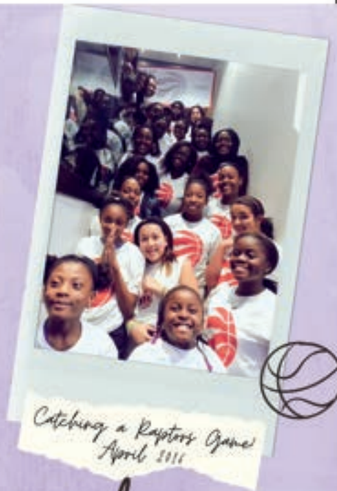
Catching a Raptors Game April 2016