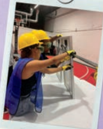
Green Energy Pre-apprenticeship Program July 2022