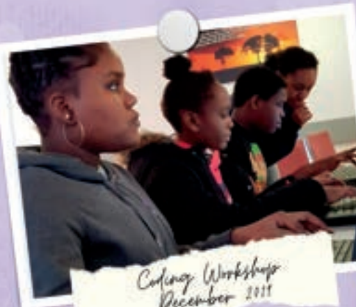
Coding Workshops December 2011