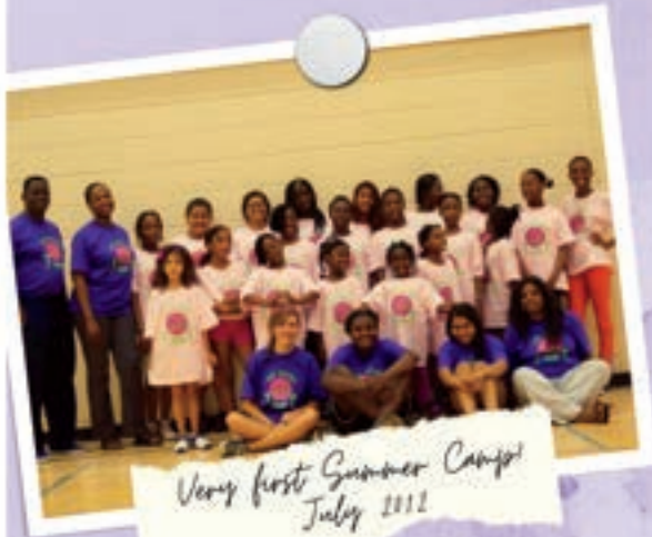
Very first Summer Camp July 2012