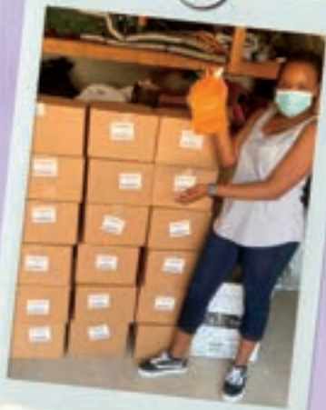
Printing for the Pandemic Boxed Camp! August 2020