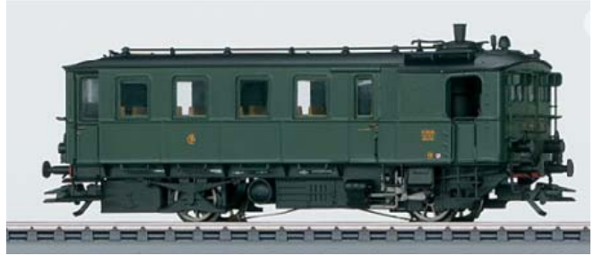
MTH RailKing O Gauge Doodlebug

Due to their compact size, Doodlebug models are attractive to model train fans. They allow us to pack a lot of action in small layouts. I have sprinkled a few pictures of small-scale Doodlebugs throughout this article.