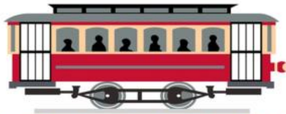
WB&A Chapter - Eastern Division - Train Collectors Association Established 1964

Tables available beginning January 1, 2023. Don't miss out on the only Annapolis Area Show.