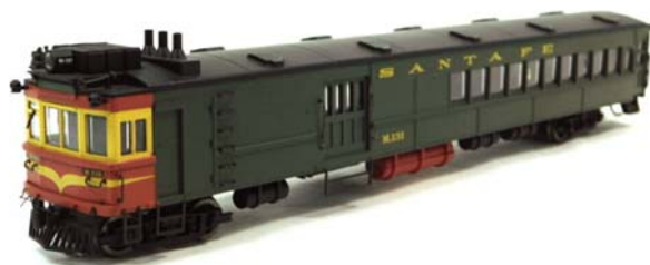
Bachmann 81403 Santa Fe Doodlebug

In Europe, steam powered doodlebugs were built in Germany, France and Czechoslovakia. They were generally referred to as a Kittel rail car. Gasoline and diesel-powered models were also developed. The steam powered Kittel was put into service in many places throughout Europe. Marklin currently offers a model of Kittel rail car.