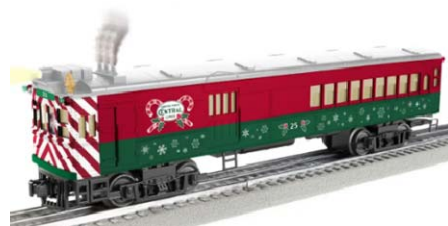
Lionel 2235090 O Christmas Lionchief Plus 2.0 Doodlebug

The Doodlebug disaster was a railway accident that occurred on July 31, 1940, in Cuyahoga Falls, Ohio, in the United States. A Pennsylvania Railroad, gasoline-powered “doodlebug” passenger rail car collided head-on with a freight train; the impact and resulting fire caused the deaths of all but three of the 46 onboard.