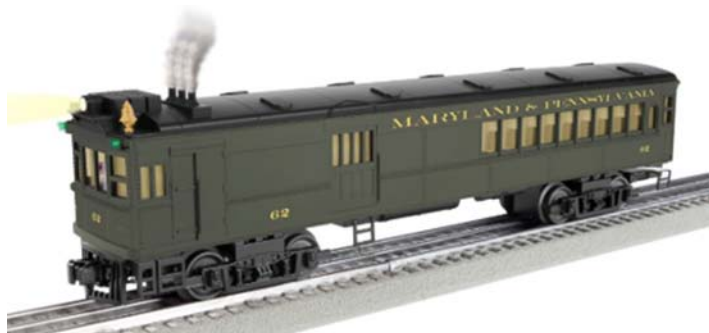
Lionel Maryland & Pennsylvania Doodlebug

The earliest history of the doodlebug can be traced back to the General Electric in 1904. It was then that the company's engineers realized that there may be a market for self-propelled rail cars in the railroad industry. They were quite different from similar cars used by the interurban and streetcar industry, which were powered by standard electricity.