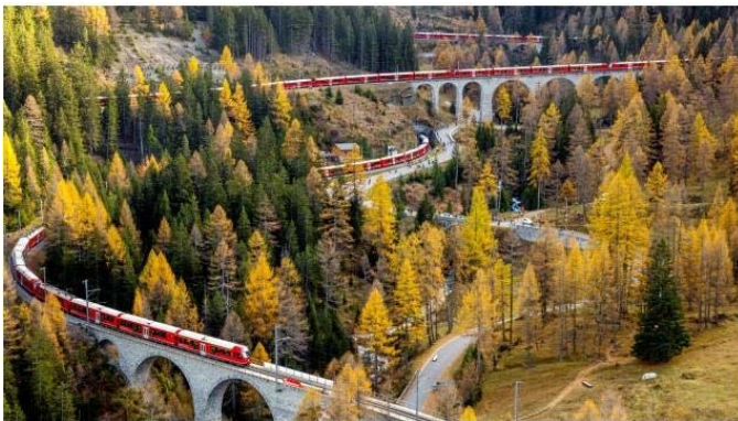
The train spiraled down a switchback of tracks through the mountains.

Following part of the route taken by the world-famous Glacier Express since 1930, the world record attempt took in the spectacular Landwasser Viaduct and the extraordinary spirals that secured the line's international heritage status.