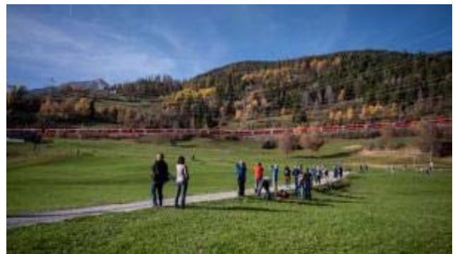
The train was made up of 100 cars.