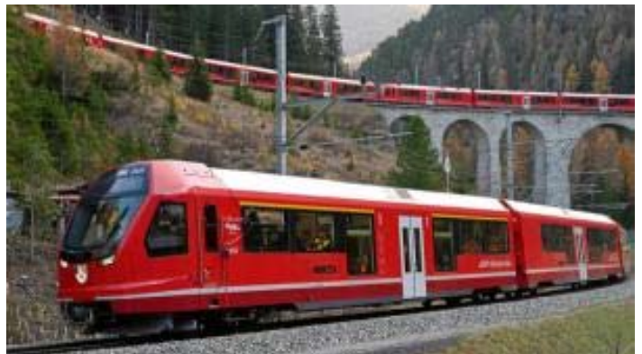
The train dropped nearly 800 meters in its descent from the mountains. (MAYK WENDT)