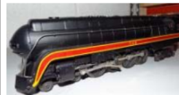
restored back to greatness.)

Woody's Train Restoration & Repair offers professional repair and restoration services for post war Lionel trains. We specialize in steam locomotives and tenders. We have the ability to repaint and rubber stamp locomotive cab numbers. We have full repair shop and can rebuild smoke units, e-units, repair whistles and rewire your locomotive to almost new. We just recently added a Lionel press and can change out broken diesel and steamer wheels and perform various other repairs. If your train needs some TLC just e-mail us ( deutsche_marine@hotmail.com ) with your needs and we most likely can help you. (Here is a sample Woody has