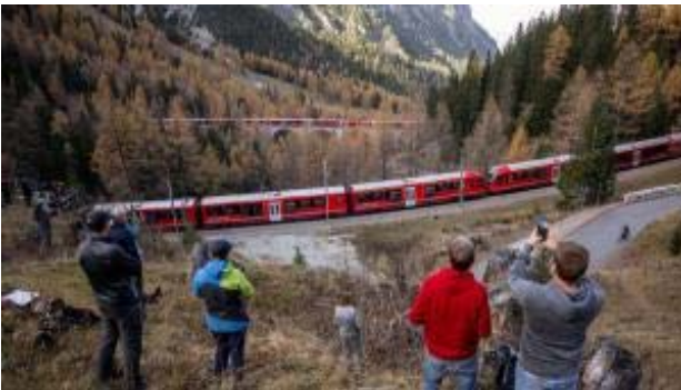
The record attempt was organized to celebrate 175 years of Swiss railways.

For a small country with a mountainous landscape which, at first glance, seems unsuited to railways, Switzerland punches well above its weight in the industry.