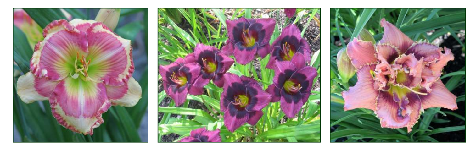
Left to right: 'Dedicated Follower of Fashion' (Rae Dickens, 2020), 'Western Reserve Quiet Night' (Del Dickens, 2016), 'Montville Sweetie' (Del Dickens, 2018)

As Rae explained: "What people typically see in garden centers and mail order companies are varieties that are older, but people don't realize it. They often offer varieties as "new." People think that means it is a brand new variety, but it is not necessarily new to the public. What the store is really saying is it is new to their garden line up, not a true new variety. When daylily folks talk about a new variety they mean registered and recently released into commerce. Without coming to our garden, website, or annual plant sale, visitors often don't realize how hard hybridizers have worked to improve and create amazing unique flowers for people to enjoy."