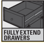
FULLY EXTEND DRAWERS