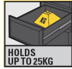
HOLDS UP TO 25KG