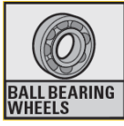
BALL BEARING WHEELS