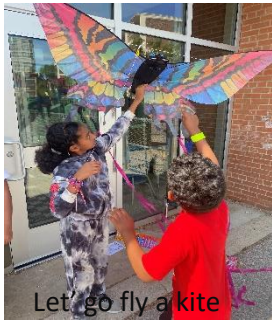
Let's go fly a kite