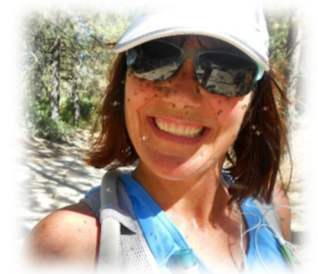
Embrace the Gnats!

Even with a cool down trend, be sure to keep hydrated during the race. Some of the trails are quite exposed, especially as you head down toward the Candy Store. If you think this race will take you longer than 4 ½ hours to finish, we highly recommend a hydration pack, as opposed to handhelds, so that you have enough fluids to last the longer stretches between aid.