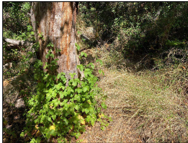
Poison Oak @ tree base

Just 2 more weeks til race time and the trails are looking pretty good. There's one downed tree early on San Juan Trail with path already worn around it. Overall, that trail is pretty well travelled and clear. Upper Chiquito(a) Trail is a little overgrown in the area near The Viejo Tie. And as usual, we've got plenty of poison oak growing along the trails. If you are not familiar with the plant, know that around 85% of the population is allergic to it. Please use caution, especially if for any reason you go off trail. You don't want to be part of that 85% and return home with a skin rash. You'll usually see the plant around the base of trees or alongside the path – it ranges in color from red to green. Be on the lookout.