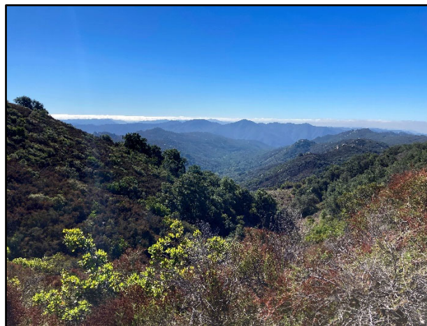
View toward Pacific Ocean from San Juan Trail