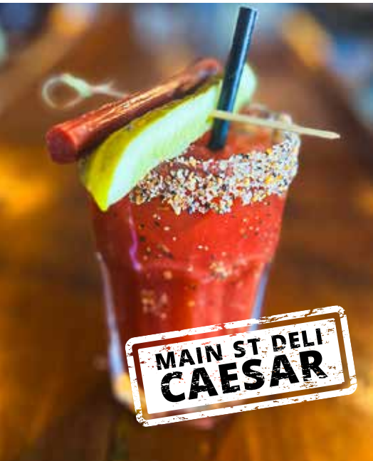
MAIN ST DELI CAESAR