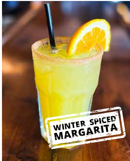
WINTER SPICED MARGARITA