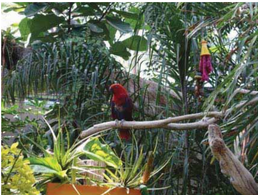
One of the many parrots in the dome jungle.

The ground floor of the dome contains many exhibits plus a walk through jungle with many live birds flying about. The second story is full of rare snakes in exotic surroundings. You can easily spend many hours at the gardens. There is a snack bar and two restaurants so you don't really have to leave. Also, a huge souvenir and book shop. But if you do get tired, just come back on another day using your season pass.