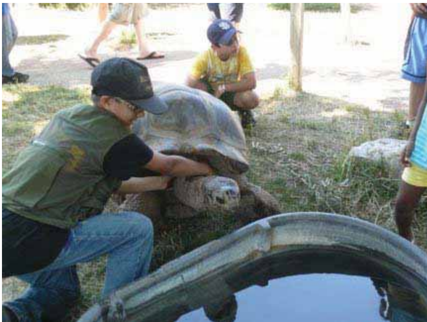
Giant tortoise exhibit.

The gardens have two giant tortoises and they are very friendly. They actually enjoy having their necks scratched. Unfortunately, Methuselah, a giant, 130 year old, 500 pound, Galapagos tortoise just recently passed away.