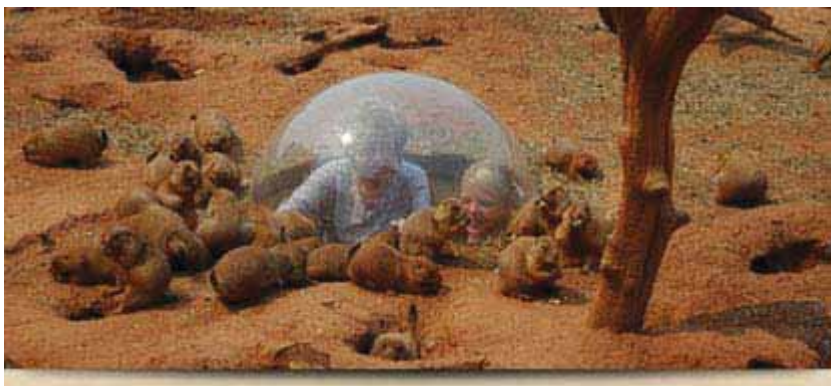
Prairie Dog town.

What the gardens called "a snake show" was actually a first rate lecture and demonstration involving several categories of snakes. At the end of the lecture, the speaker held a live albino python for anyone who wished to pet this very large snake. Not too many adults lined up, but the kids all wanted to pet the snake.