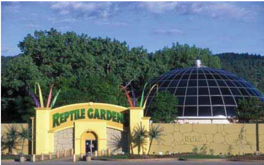
Entrance to Reptile Gardens.

In this issue, we would like to tell you a little bit about an extremely interesting attraction: REPTILE GARDENS . The Reptile Gardens was started by Earl Brockelsby in 1937 and is still going stronger than ever.