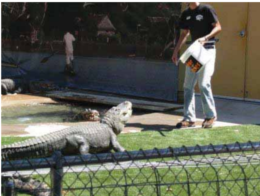
The gator show.

The prairie dog town exhibit was quite unusual in that you could go underground and come up in a plastic bubble and view the prairie dogs eye to eye.