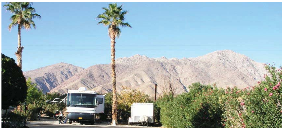
Holiday Homes Mobile and RV Park in Borrego Springs, California

The terrain of this park varies tremendously. It goes from flat with lots of Jeep trails to extremely rugged like the above photos and then up into the mountains with pine trees. Right in the middle of the park is a nice little town called Borrego Springs . Hotels, restaurants and all the amenities. The town has several RV parks and there is also a State run RV park right near the visitor center. Of course, there are lots of camping sites and tent sites throughout the park. Miracle of all miracles, there are very nice places out in the desert to park your RV and ride your dirt bikes. The park actually caters to motorcycle riders and has built lots of sunshades with picnic tables for them.