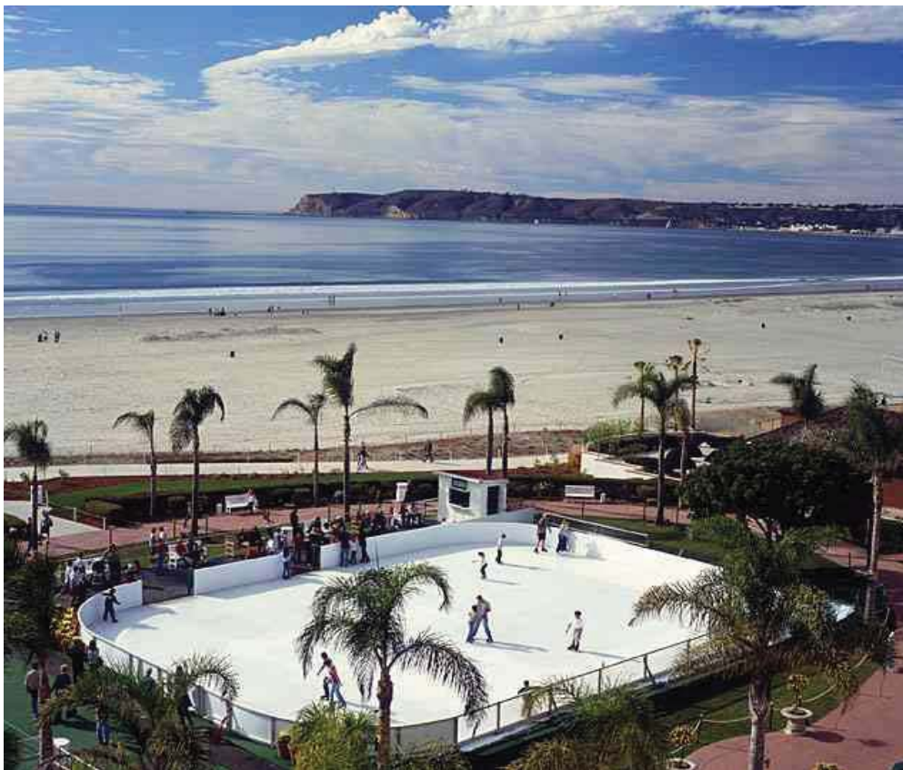
Ice skating at the Hotel Coronado