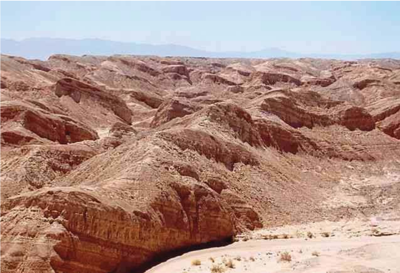
Anza Borrego Desert State Park