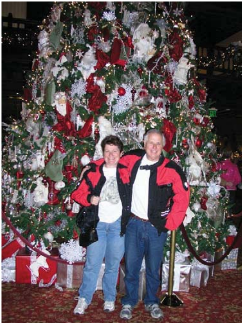
Lobby of the old Coronado Hotel 2006