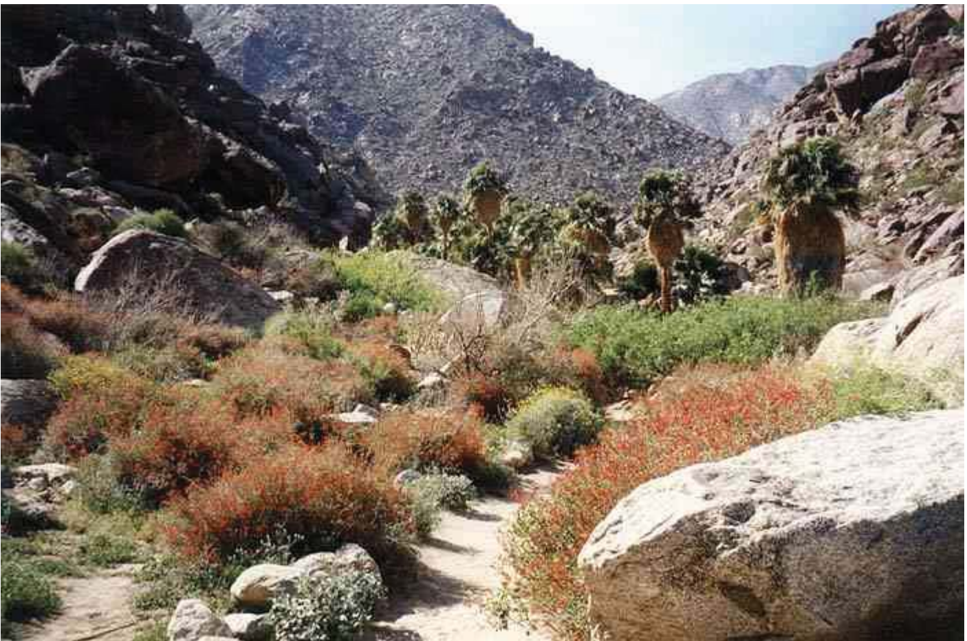
Anza Borrego Desert State Park