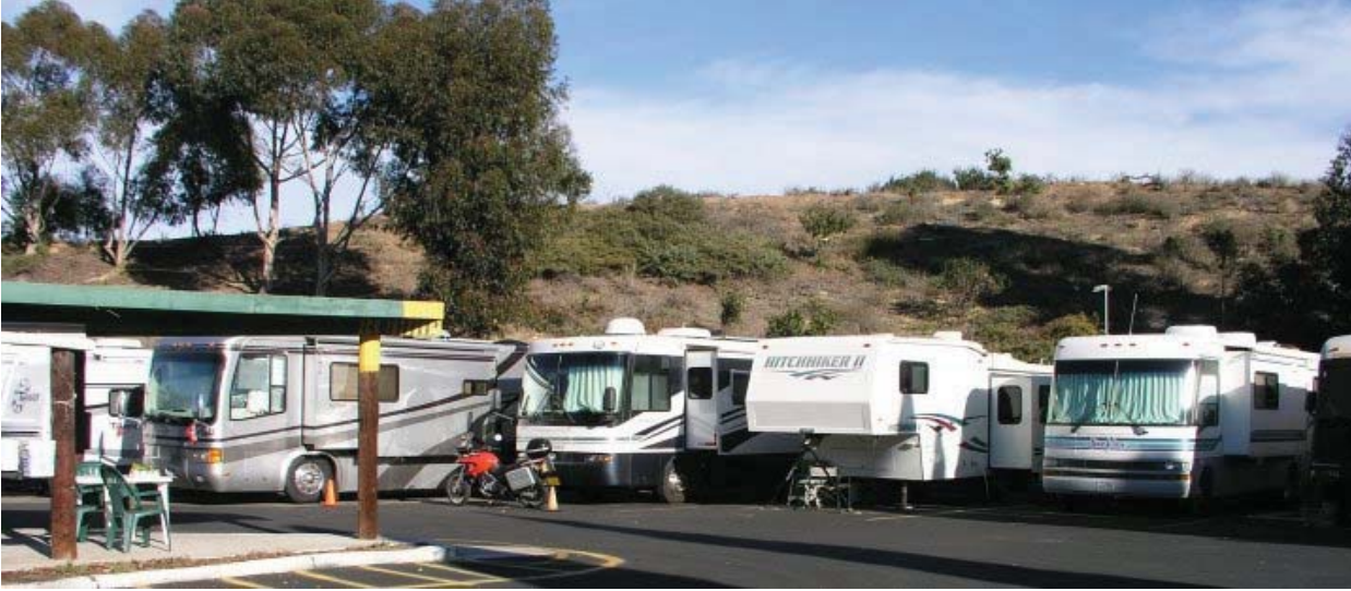
Elks RV Park in Chula Vista, California

Springs. They provided us with a lovely, large and private place to park. The air was clear and the view was fabulous. We spent two lovely days there.