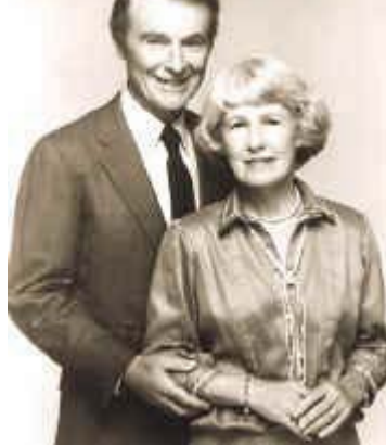
HERE WE COME