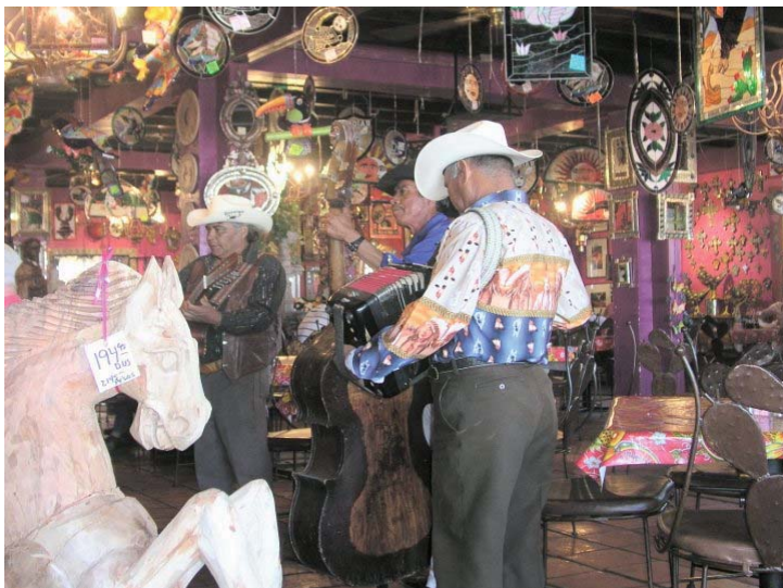
Mexican musicians in the restaurant at the Pink Store.

We strongly recommend a visit to Columbus. The railroad station museum is worth visiting as is the museum in the state park. Incidentally, the state park has a darn nice RV park.