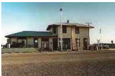
Railroad Station Museum, Columbus, NM.

citizens. This sleepy little town was caught completely by surprise as were about 350 U.S. Army soldiers who were stationed there. It appears that Pancho was after supplies and not particularly interested in killing. The U.S. Army caught on fairly quickly and killed at least 70 of Pancho's men and drove them back across the border. The U.S. response was dramatic. General John J. "Black Jack" Pershing arrived in Columbus to lead a punitive expedition into Mexico to find and capture Pancho Villa. Within one day, the first of several thousand troops began to arrive in Columbus. The troops supported by airplanes and trucks ventured 300 miles into Mexico. This was the first time that our Army had been so mechanized. Was it actually a test run of our equipment in preparation for World War I?