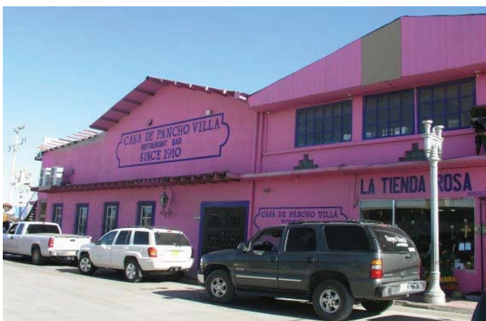
The Pink Store, Palomas, Mexico.

Columbus is still a little sleepy town, but worth a visit because of its interesting history. It's also a great place to cross into Mexico. You can walk right in and darn near walk right out. The border is open 24 hours and does not have the long lines we have seen in other border crossings. There is a great bar, restaurant and shop called the Pink Store . A lot of the citizens from Deming drive the 30 miles to cross the border and have drinks and dinner at the Pink Store which is in the Mexican town of Palomas .