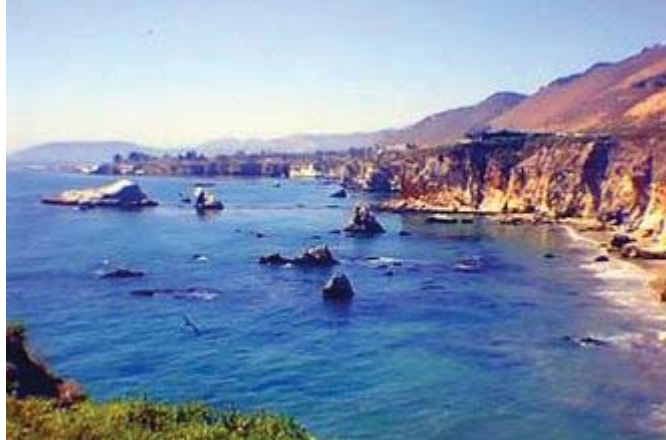
Morro Bay Shell Beach