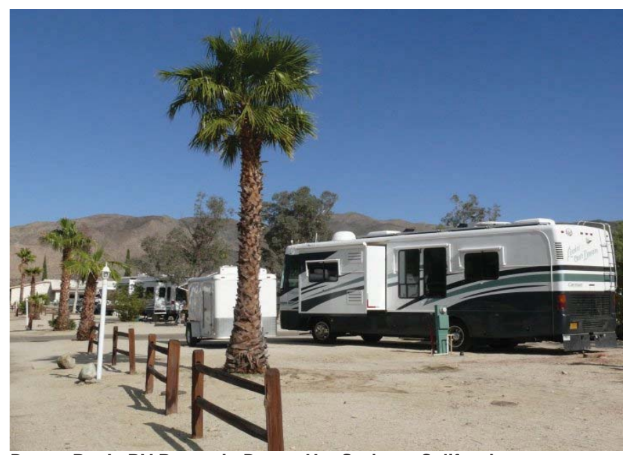
Desert Pools RV Resort in Desert Hot Springs, California

But let's back up a little. We left San Luis Obispo , California, where you heard from us last and ran straight to the Elks Lodge in Oxnard , California. We got there in time to set up in the parking lot, go inside and have a drink, and have a nice dinner. In the morning we rolled early and got to Desert Pools RV Resort in Desert Hot Springs , California. Desert Pools is our home park in the Western Horizons system and we went there to clear up some questions about our membership and to convert our 5 year temporary membership to a lifetime membership. That set us back $1,249. Well that's it, we're paid up permanently. The weather in Desert Hot Springs was absolutely fabulous. The air was clear, no wind, and a very pleasant temperature. We only stayed 2 nights as we had an appointment with Satellite Advantage in Quartzsite , Arizona. So on November 20, 2007, we arrived at the satellite shop and they went right to work.