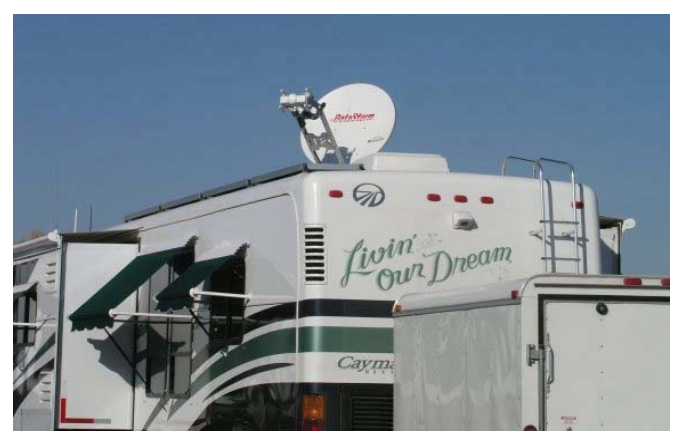
The big Internet satellite dish back in operation

We opted for a little slower Internet connection to save a few bucks, but now we don't have enough speed to be able to use Skype Internet phone. We miss talking to our old Skype friends so we might have to pick the speed up on the satellite again one of these days. In the meantime, we can probably use Skype in areas where we have broadband on our Verizon aircard. Unfortunately, this is not one of those areas.