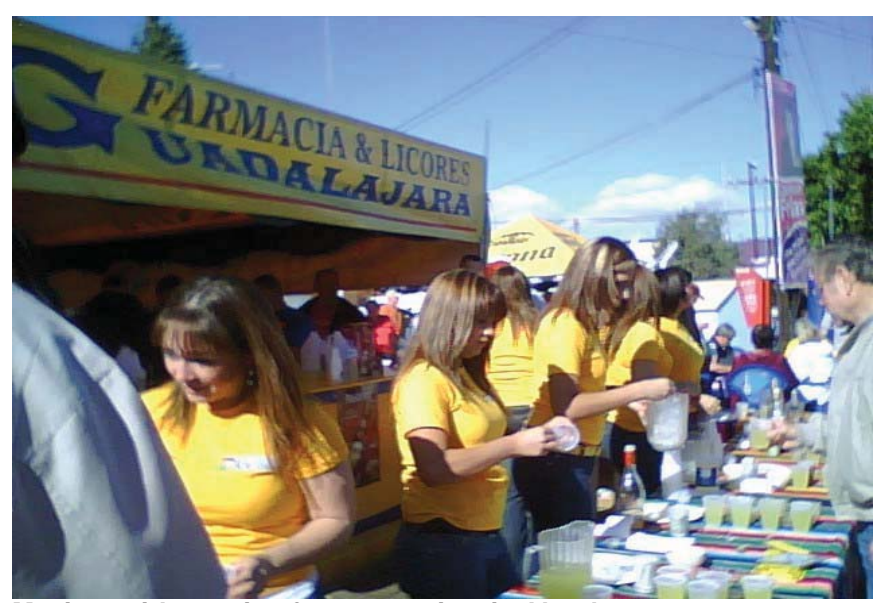
Mexican girls serving free margaritas in Algodones

On a much lighter note, yesterday, December 8, Algodones threw a Winter Visitors Appreciation party. They blocked off a street downtown, set up a stage, set up hundreds of chairs with dozens of booths lining the sides. The weather was sunny and lovely and there was more than 5 hours of free entertainment. Dancers, singers, bands, cheerleaders, etc., just plain fun and all free. In addition, booths were set up with tons of free food. Not just a taco, but complete free full lunches. In addition to the food, there was all of the free tequila, margaritas, and draft beer you could drink. There was an amazing number of drunk on their butts, senior American citizens. They were wiped out, singing, dancing, yelling, and falling down. Wow, what a country! Drinking in the streets to total excess.