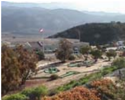
Office and Ranch House Clubhouse Patio