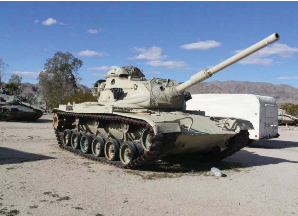
General Patton statue