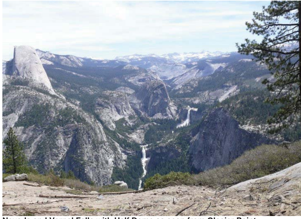
Nevada and Vernal Falls with Half Dome as seen from Glacier Point.

At this point, we have a bit of a dilemma. We have a car load of Yosemite pictures, but if we show many more, your download will take forever. So, we had better show just a couple more and sign off.