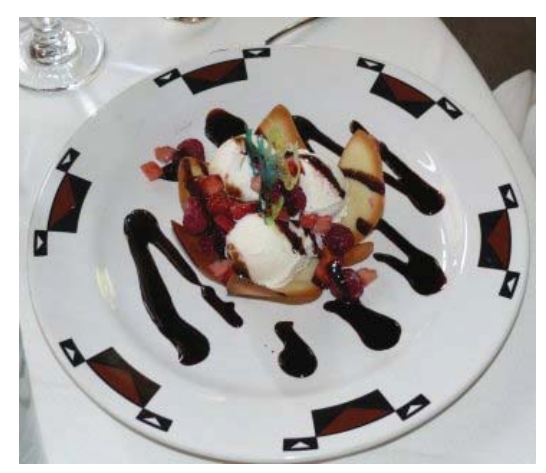
Chuck's chocolate sundae.

The Ahwahnee Hotel is very old, but in pristine condition. It's just flat beautiful and the food is elegant, grand, and really, really good. The pastry chef is superb and the desserts are to die for. It wasn't on the menu, but Chuck wanted a plain old chocolate sundae. Everyone else had exotic works of art. Well, his chocolate sundae turned out to be super delicious and a custom made work of art. Three scoops of vanilla ice cream cradled in light and thin pastries topped with fresh raspberries, delicious chocolate syrup and some kind of ornamental, but edible decoration. If you haven't eaten at the Ahwahnee Hotel in Yosemite Valley, do it. It's not cheap, but it's worth every penny.