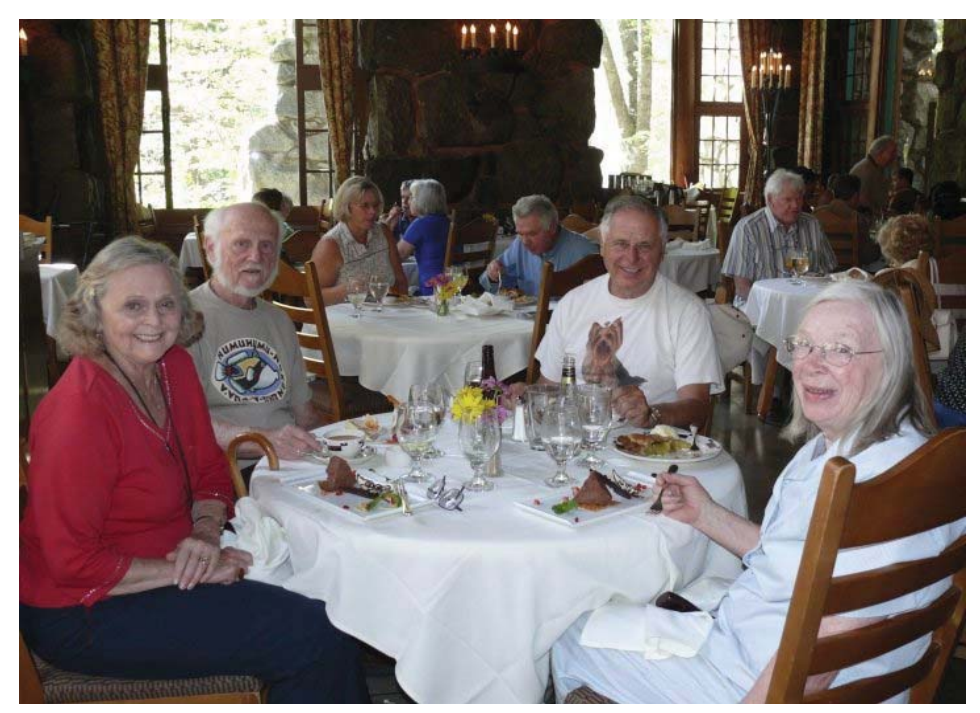
Lunch at the Ahwahnee Hotel.

tough. They wore us out. They drove up from the San Francisco Bay Area and then threw a BBQ dinner for us the same night. The next day, they picked us up early, drove us to Yosemite Valley , then up to Glacier Point , then back to the Valley for a late lunch at the Ahwahnee Hotel .