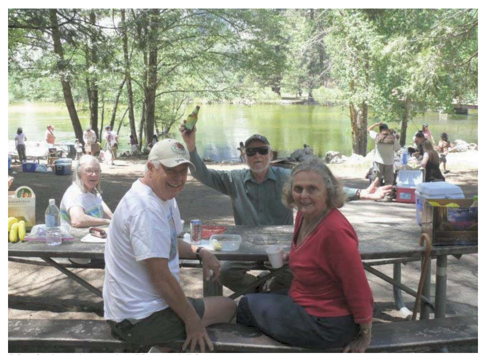
Picnic lunch on the Merced River.