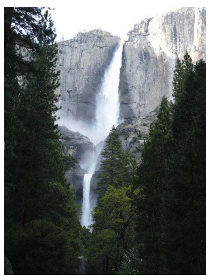
Upper and Lower Yosemite Falls.

At this point, we have a bit of a dilemma. We have a car load of Yosemite pictures, but if we show many more, your download will take forever. So, we had better show just a couple more and sign off.