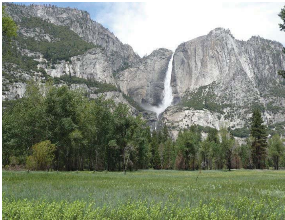
Upper Yosemite Falls.

Did you know that Yosemite was America's first Federally protected Wilderness Area? The legislation was signed in 1864 by Abraham Lincoln. The history of the park is extremely interesting and we may tell you more about it at a later date.