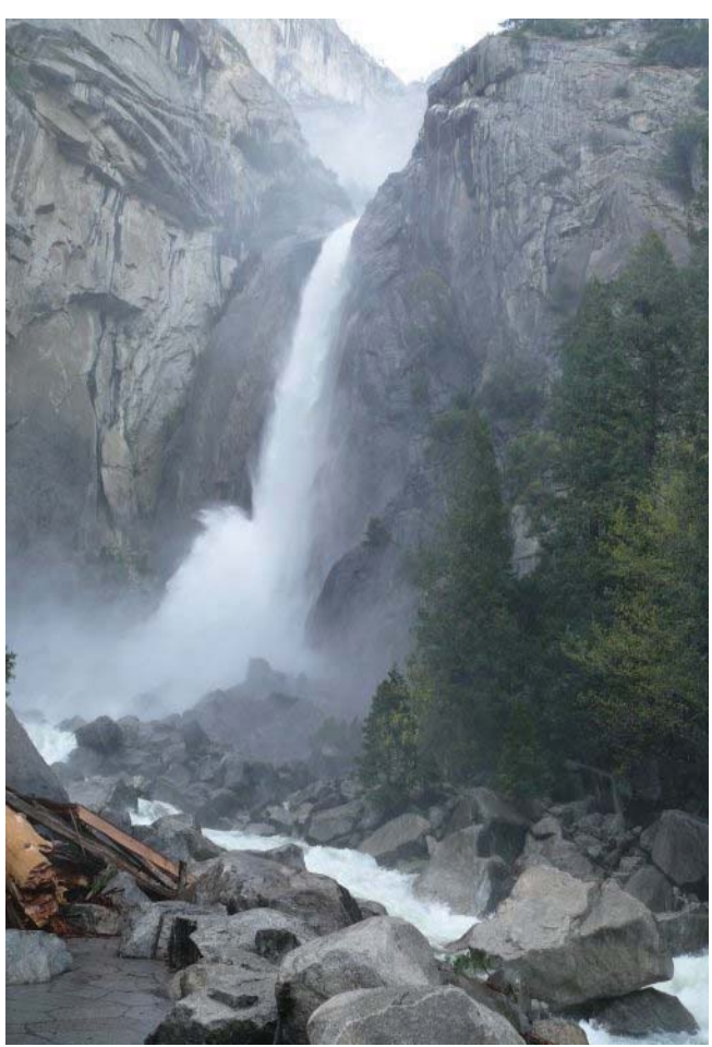
Lower Yosemite Falls.

Lower Yosemite Falls had so much water that is was creating its own very strong wind. The wind picked up the mist which made the trail very cold and wet.