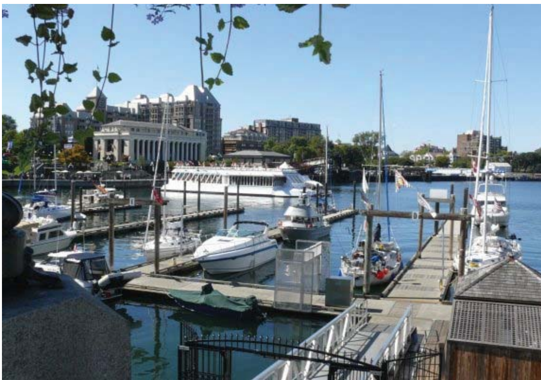
One of the small boat harbors of Victoria's Inner Harbor.

Much of the inner harbor has a lovely promenade that allows a person to walk between attractions. The picture below is taken from the promenade and shows one of the harbors in the foreground. The large white boat in the middle of the photo is actually permanently moored in that location and has a glass bottom which allows tourists to view the sea life of the inner harbor. A scuba diver goes down to feed the fish on a regular schedule making the viewing more interesting. The building just to the left of the glass bottom boat is a wax museum.