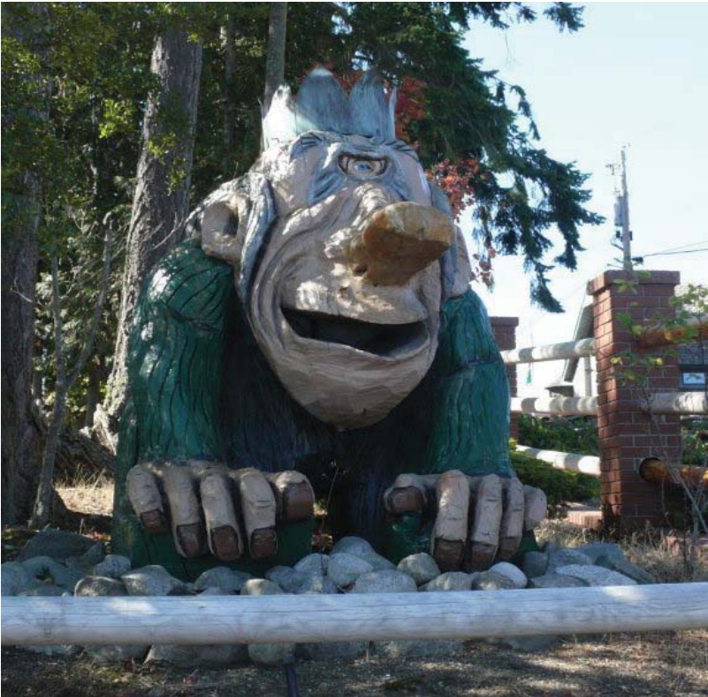
Hand carved troll at Bandy's Troll Haven.