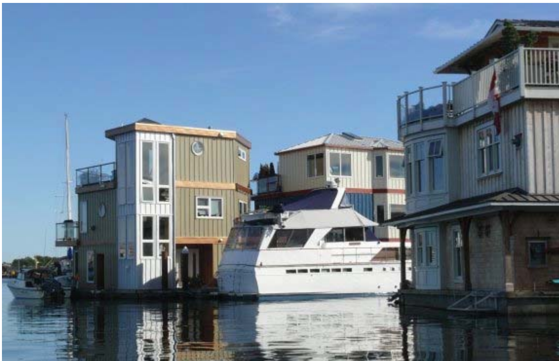
Expensive floating homes in Victoria's Inner Harbor.

Much of the inner harbor has a lovely promenade that allows a person to walk between attractions. The picture below is taken from the promenade and shows one of the harbors in the foreground. The large white boat in the middle of the photo is actually permanently moored in that location and has a glass bottom which allows tourists to view the sea life of the inner harbor. A scuba diver goes down to feed the fish on a regular schedule making the viewing more interesting. The building just to the left of the glass bottom boat is a wax museum.