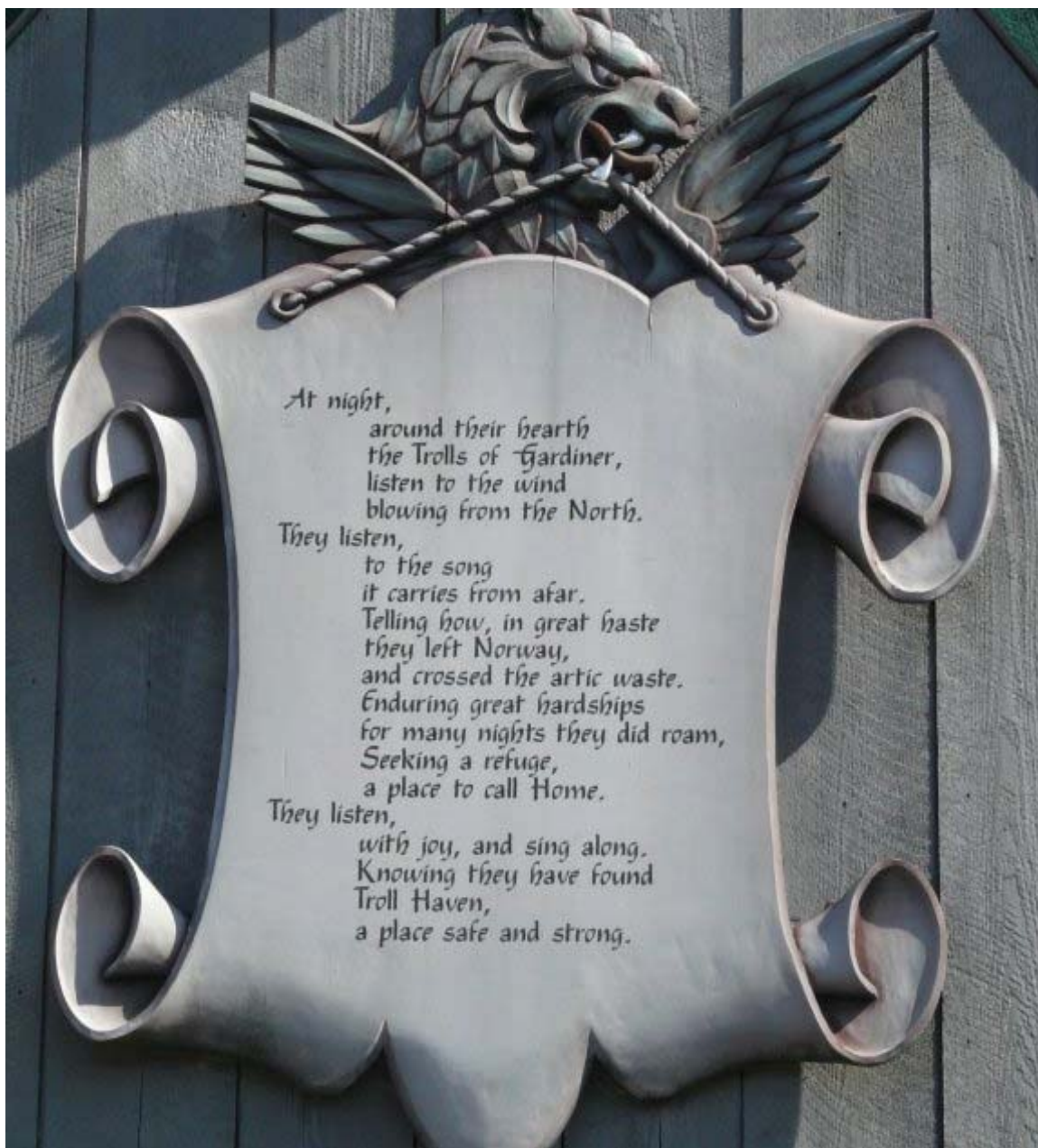
Interesting plaque hanging over one of the doorways.

Our stay in Sequim was limited to the two weeks that we could spend free at Diamond Point RV Resort . There was so much more to see that we will definitely have to return. But enough for now.