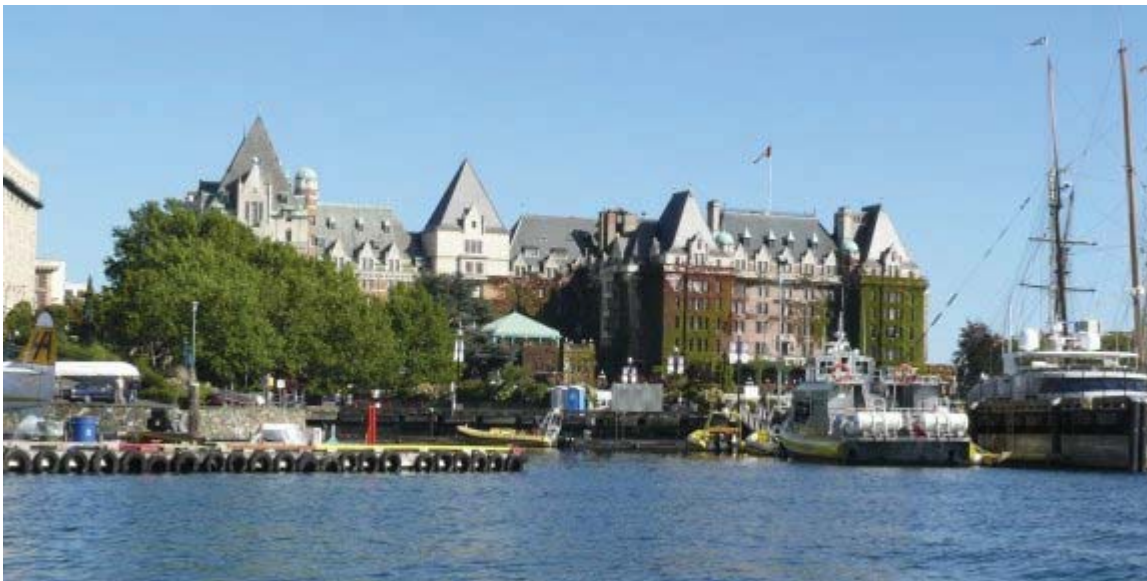
Empress Hotel as seen from a water taxi.

When last you heard from us, we had just completed our tour of the fabulous Butchart Gardens . After that, we hopped on our double decker bus and continued our tour of the city of Victoria on Vancouver Island . The various neighborhoods were interesting and worth seeing. Our bus tour ended back at the beautiful Victoria Inner Harbor. We walked to one of the many harbor restaurants and had a nice lunch. With a couple of hours to kill before the ferry back to Port Angeles , we chose to see more of the beautiful inner harbor by a cute little water taxi.