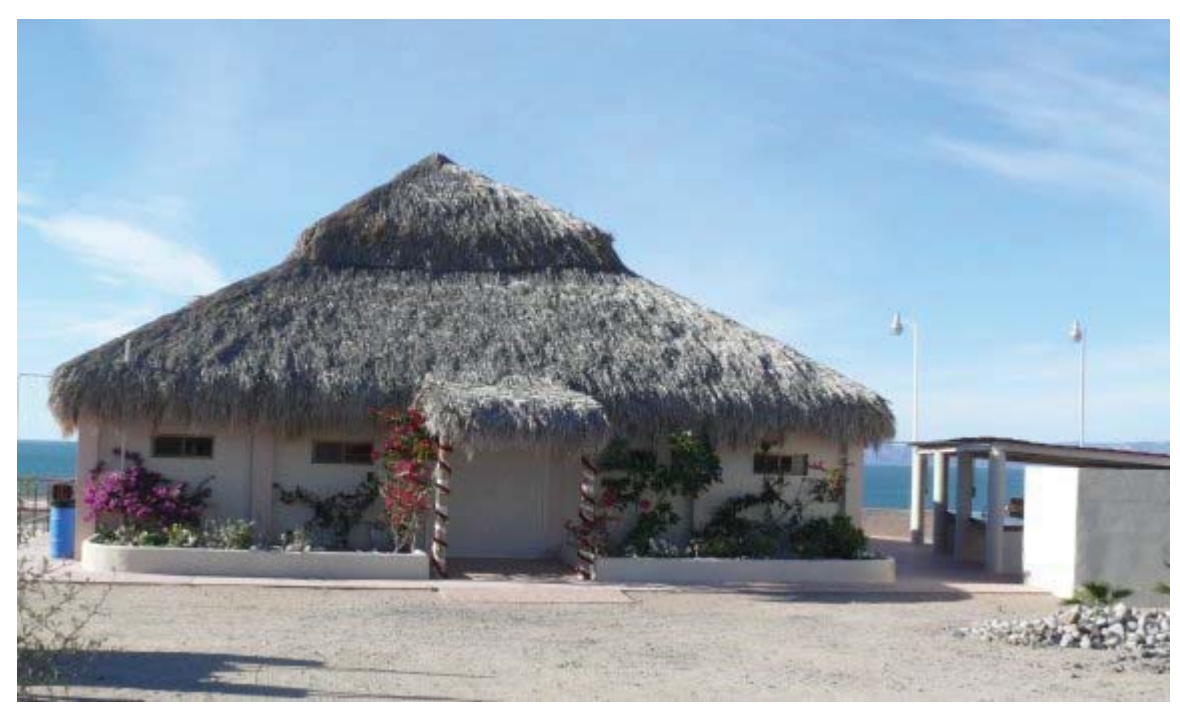
WHR Kino Bay clubhouse.

The first night that we arrived in the park, there was a very nice potluck dinner with the RVers and some of the villagers and their children. The village women supplied a huge quantity of paella, which is a Mexican dish composed primarily of fish, sausage, and rice. The park and the RV community supplied a gift for every Mexican child delivered by Papa Noel (Santa Claus.) It was quite lovely and the small children were thrilled.