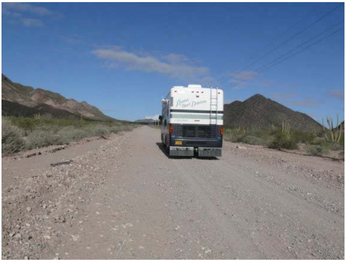
Our motorhome on a good section of the bad road from New Kino to the WHR RV park.

Let's back up and deal with the basics. Where is Kino Bay? It's on the mainland side of the Sea of Cortez , located 68 miles west of Hermosillo . It is a village of approximately 5,000 people and has one of the most beautiful beaches in the state of Sonora. Eight miles of white sand beach, good fishing, and a relaxed atmosphere, make Kino Bay an interesting vacation spot.