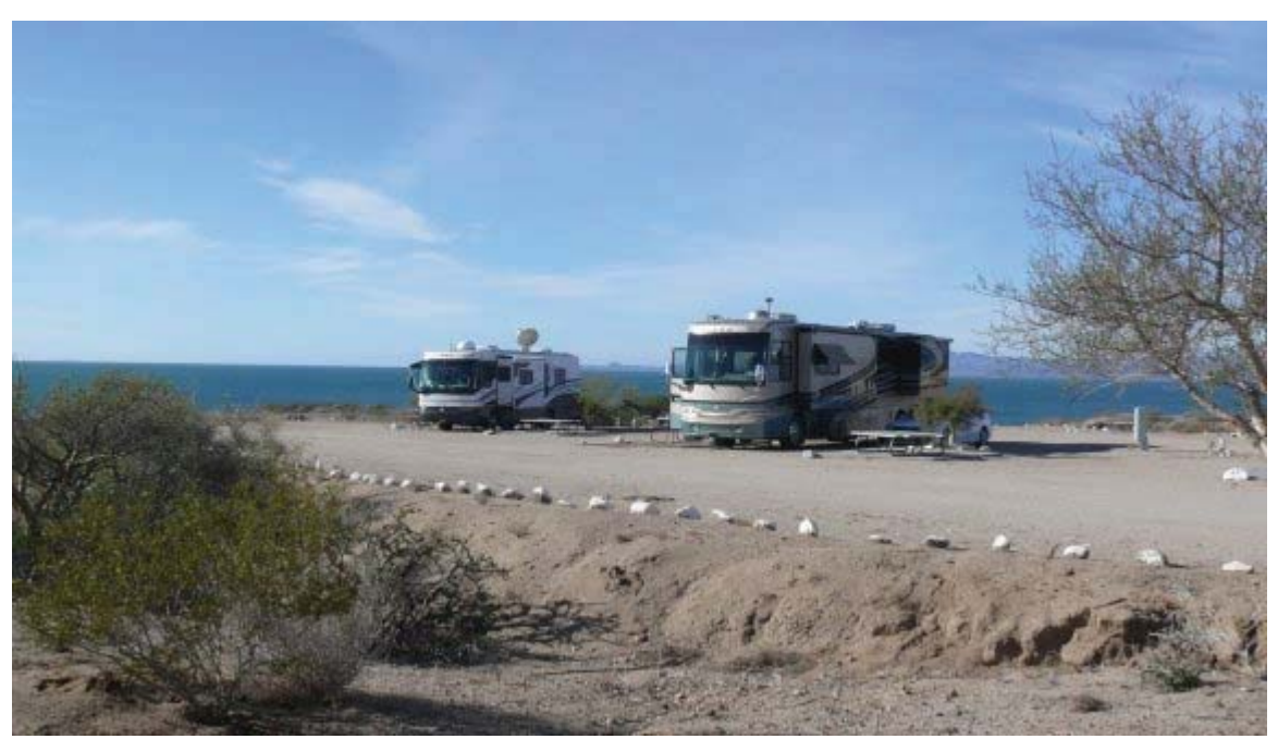
Peg and Jim's motorhome in the foreground, Chuck and Donna's in the background.

The park is quite large, and at the moment, only has about 25% occupancy. It has 30 amp power with voltage that tends to be on the high side. Because every drop of water is trucked to the park from town, we are hooked up to metered water and entitled to use 75 liters per day, which turns out to be plenty. We can easily get along on half that much. Five gallon bottled drinking water is available for purchase in the office. We drain our grey water into a small pipe at the site. We think it just goes into the sand. Once a week, a truck comes by and pumps out the black tanks.