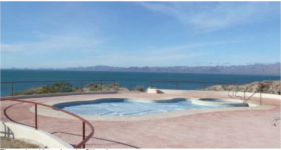
The pool and hot tub at the RV park.

The park is quite large, and at the moment, only has about 25% occupancy. It has 30 amp power with voltage that tends to be on the high side. Because every drop of water is trucked to the park from town, we are hooked up to metered water and entitled to use 75 liters per day, which turns out to be plenty. We can easily get along on half that much. Five gallon bottled drinking water is available for purchase in the office. We drain our grey water into a small pipe at the site. We think it just goes into the sand. Once a week, a truck comes by and pumps out the black tanks.