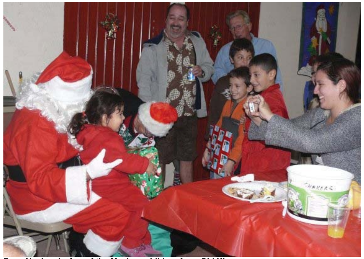
Papa Noel and a few of the Mexican children from Old Kino.

The first night that we arrived in the park, there was a very nice potluck dinner with the RVers and some of the villagers and their children. The village women supplied a huge quantity of paella, which is a Mexican dish composed primarily of fish, sausage, and rice. The park and the RV community supplied a gift for every Mexican child delivered by Papa Noel (Santa Claus.) It was quite lovely and the small children were thrilled.