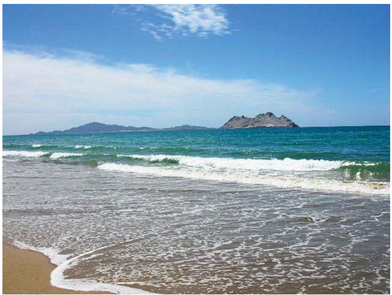
Beach at Kino Bay with Tiburon Island in the background.

The next basic question is, is it worth the trip? It's probably a little too soon to know. We like to go to Mexico to experience the Mexican climate, culture, people, and food. Here at Western Horizons Kino Bay, we certainly have the climate. We are clearly in a Mexican desert on a bluff above the very beautiful Sea of Cortez. But it doesn't feel like Mexico. We are isolated from town by a difficult road through the mountains. We are parked with about 40 other Canadian and American RVers. There are no Mexicans here. No restaurants, no bars, no shops, and very few vendors. It feels more like the middle of nowhere in Arizona except for the Sea of Cortez. Most of the folks here absolutely love the place and come back for months at a time every year. They have been very hospitable and clearly want to share their love of this unique location.