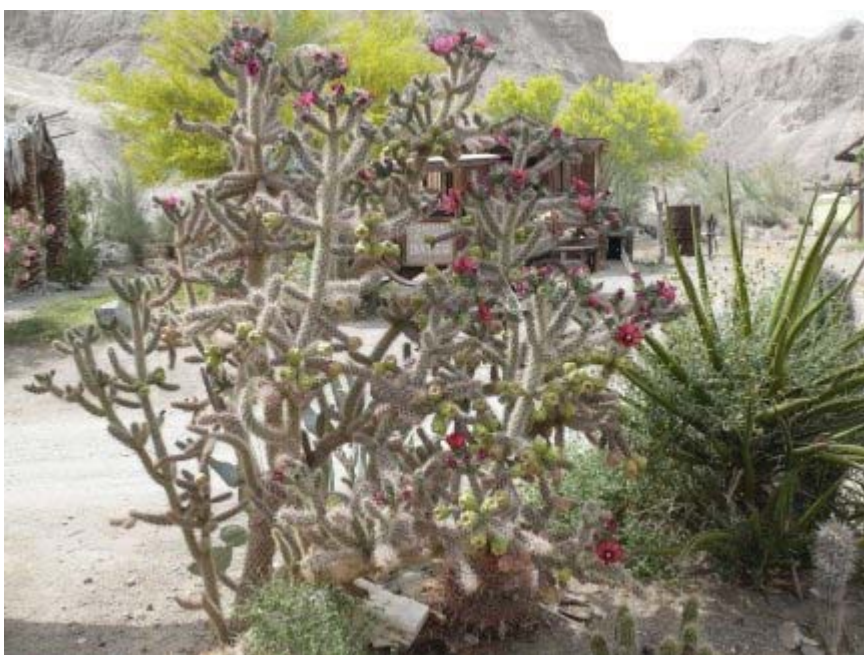
China Date Ranch with blooming cactus.

Today the date ranch is a very interesting and historical stop. There is a gift shop, a bakery, and you can also buy a variety of potted cactus and date trees. You can also buy a cold drink or a great date shake. If you get anywhere near Pahrump or Death Valley, be sure to visit the China Date Ranch.