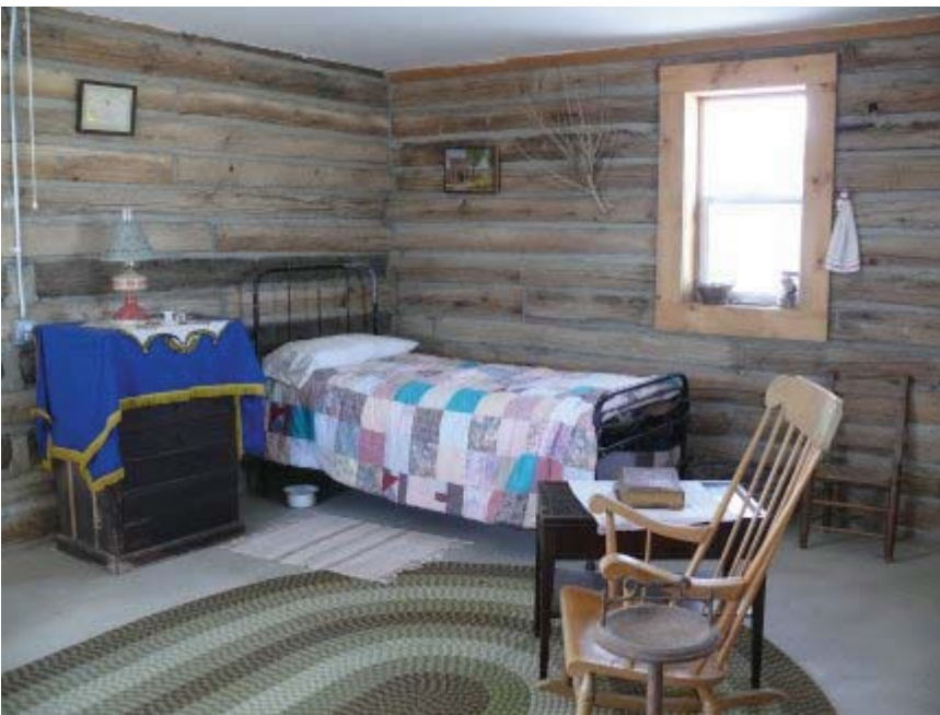
Restored Pahrump one room pioneer cabin.

The museum has a large and comprehensive Abraham Lincoln collection. While looking through the room dedicated to "Honest Abe," Chuck was captivated by a plaque. It was entitled "Ten 'Cannots' by Abraham Lincoln." Abe had a pretty good understanding of democracy and freedom and we wish this understanding were more prevalent today.