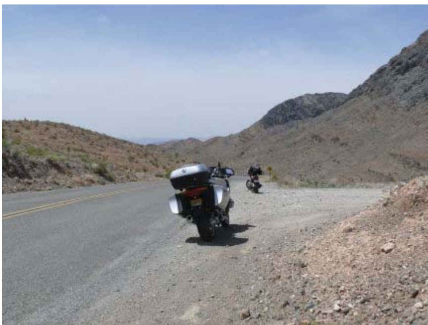
Road to China Date Ranch.