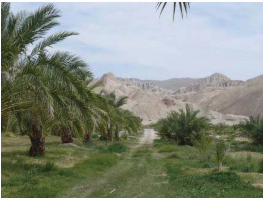
China Date Ranch.

Today the date ranch is a very interesting and historical stop. There is a gift shop, a bakery, and you can also buy a variety of potted cactus and date trees. You can also buy a cold drink or a great date shake. If you get anywhere near Pahrump or Death Valley, be sure to visit the China Date Ranch.