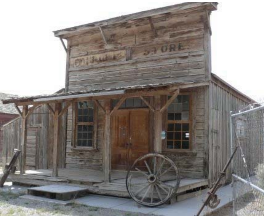
Early Pahrump General Store.