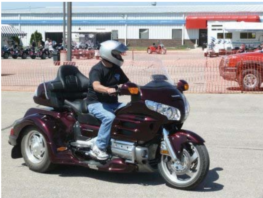
Chuck on a Honda trike.