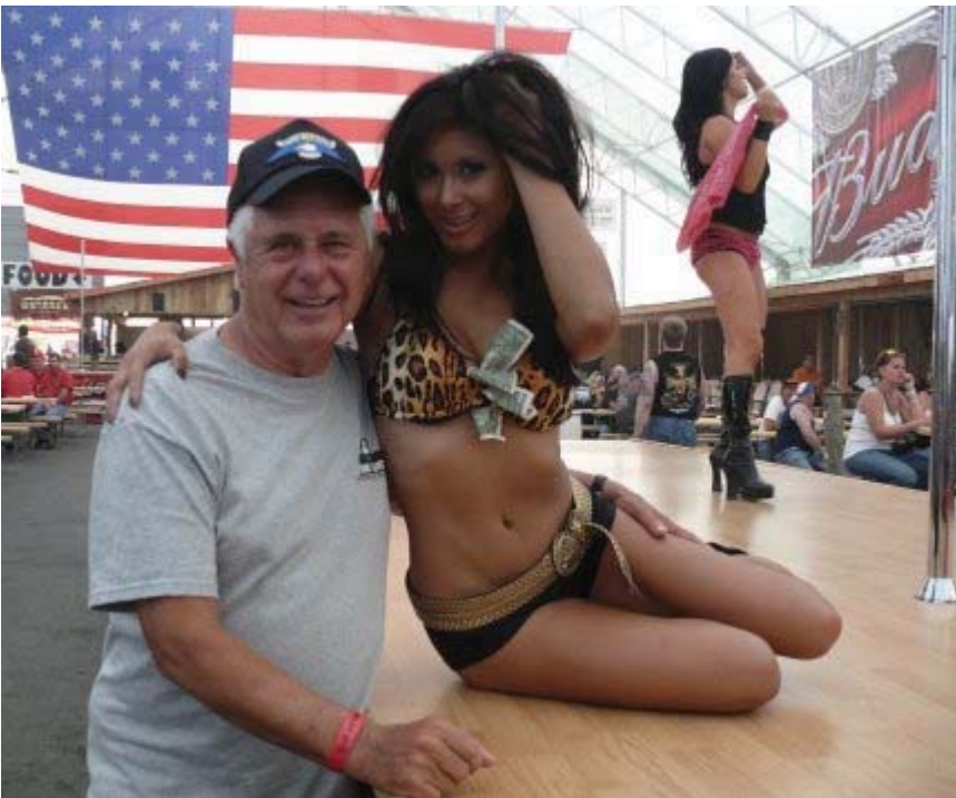
Chuck's second new friend.