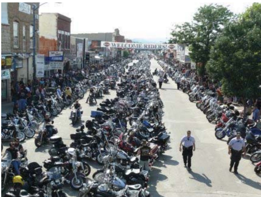
Sturgis Main Street, August 3, 2009.

Oh what a gas that was! About half a million motorcycles. Almost all of them were Harleys ridden by people who don't wear helmets. What can we say? I guess they know what their brains are worth. Businesses spring up all around Sturgis just for the motorcycle rally. Bars, campgrounds, entertainment, vendors, restaurants, all open for no more than two weeks. We stayed at Shade Valley Campground which has a huge beautiful lodge, an indoor bar, an outdoor bar, a convenience store, a restaurant, 275 full hookup RV sites, tents and cabins. All in all, a very large capital investment and yet, they are only open two weeks a year. But during Bike Week, things get very expensive everywhere you go, and so even two weeks a year is profitable.