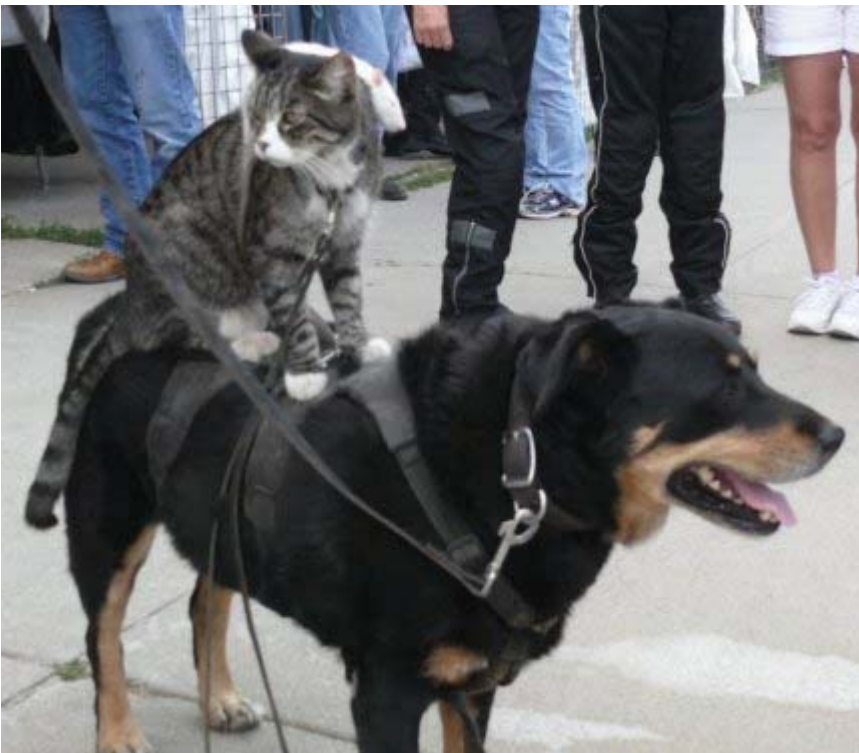
Dog, Cat, and Rat on a Sturgis street.

One of the more unusual bits of entertainment just walking down the street was a very mellow dog with a cat on its back. Well, not too unusual you say and you'd be right. But here is the kicker. There was a live white rat draped around the cat's neck. Trust us. We checked closely. All three animals were alive and well.