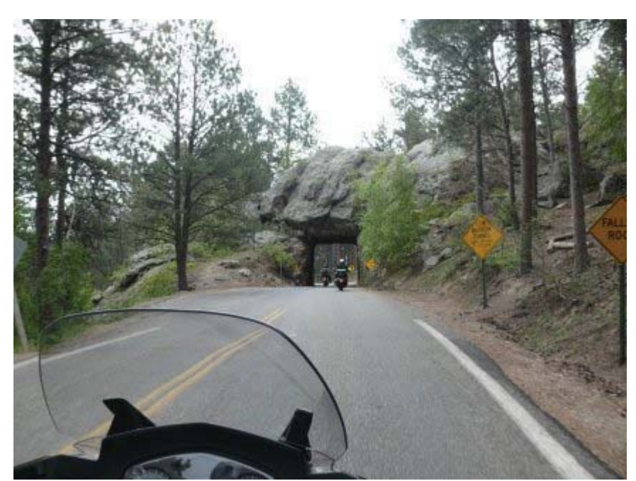
Two lane road with narrow tunnel.

Custer State Park also has free roaming wild burros. But unlike the burros of Nevada, these are moochers. They know that cars contain food and maybe somebody will give them a handout. Apparently motorcycle riders don't feed them as they completely ignore motorcycles.