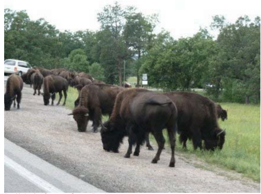
Buffalo in Custer State Park

Feel the thunder and join the herd at the 43rd Annual Custer State Park Buffalo Roundup. Watch cowboys and cowgirls as they roundup and drive the herd of 1,500 buffalo into the buffalo corrals. Following the actual roundup stay and watch as park staff sort, brand, and vaccinate the herd in preparation for the fall Buffalo Sale.