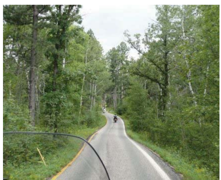
Over the hills and through the woods...

We have dozens of spectacular photos taken while riding through the Black Hills. We can't include them all, but maybe you get the idea. The Black Hills of South Dakota has spectacular motorcycle riding.