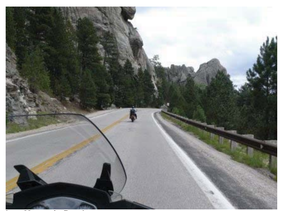
Iron Mountain Road.