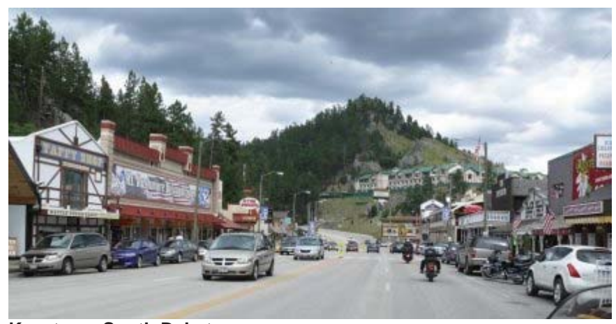
Keystone, South Dakota.