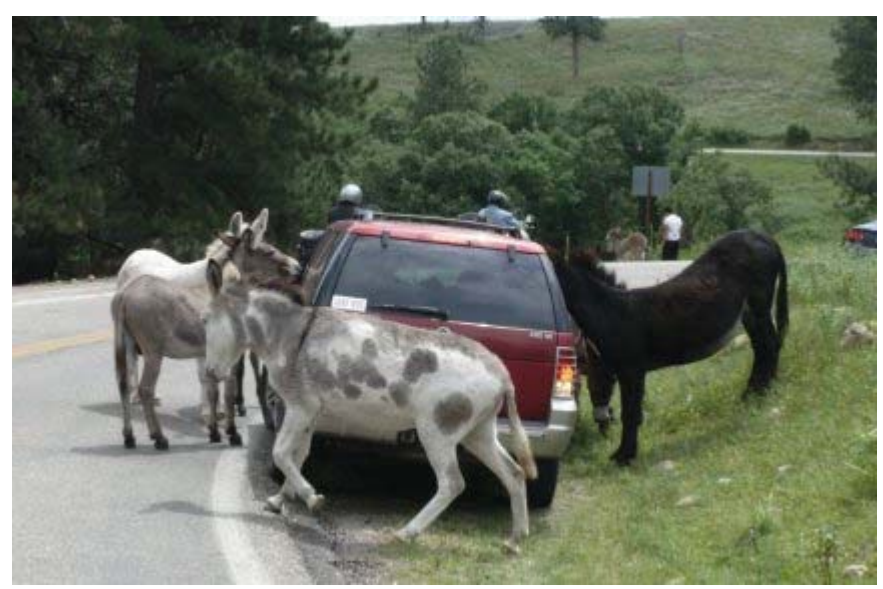
Wild burros in Custer State Park.

Custer State Park also has free roaming wild burros. But unlike the burros of Nevada, these are moochers. They know that cars contain food and maybe somebody will give them a handout. Apparently motorcycle riders don't feed them as they completely ignore motorcycles.