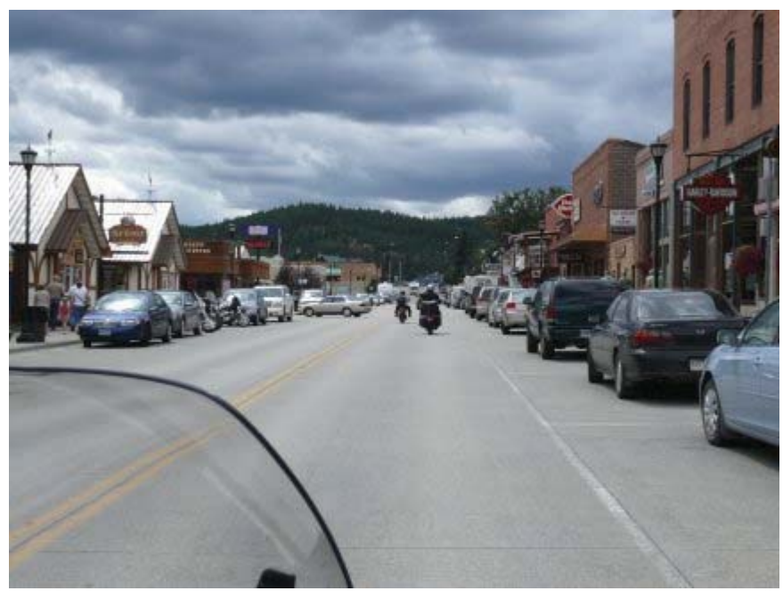
Hill City, South Dakota.