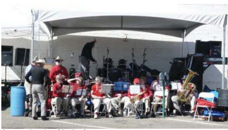
German band at Oktoberfest.