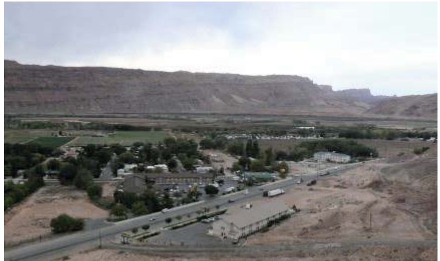
Moab Valley from The Sunset Grill restaurant.

Let's back up a little and tell you a little bit about Moab, Utah. Without a doubt, Moab is a tourist town and we loved it. Lots of fun restaurants and tours of every possible kind. It's really a fun place with two incredible scenic attractions, i.e., Arches National Park and Canyonlands National Park .