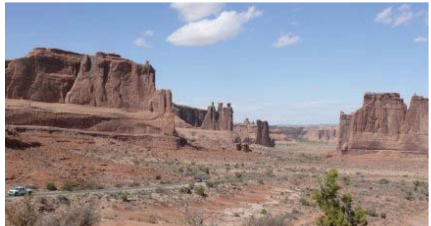
Courthouse Towers with the Three Gossips.

stops you come to. It's so grand that it takes your breath away.