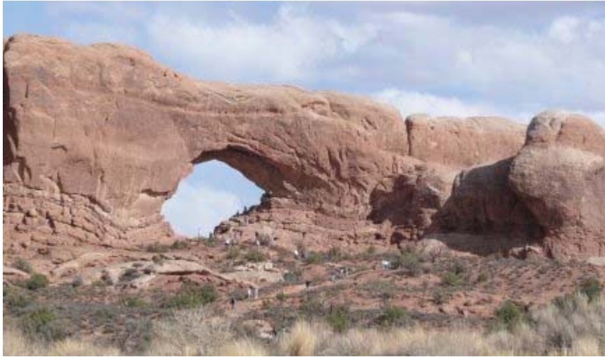
South Window Arch.

North and South Window Arches are right next to each other. They are huge. The little specks under South Window Arch are hikers!