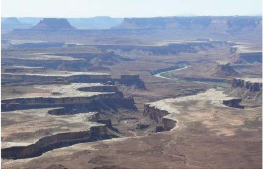
Green River overlook.