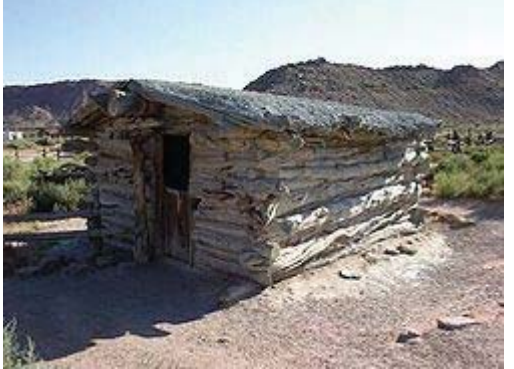
Wolfe Ranch one room cabin in Arches N.P.

North and South Window Arches are right next to each other. They are huge. The little specks under South Window Arch are hikers!