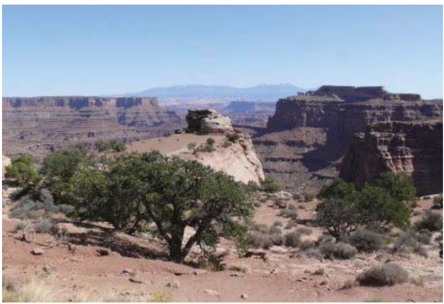
On top of the Island in the Sky mesa.

Just a half hour west of Moab is the spectacular Canyonlands N.P. It is just as awe-inspiring as Arches, but in a completely different way. At Arches, you tour from spot to spot and generally look up to see a spectacular rock formation. At Canyonlands, you tour from spot to spot and look down into deep and spectacular canyons. Canyonlands is Utah's largest national park, but it is very difficult to see all of it. The park is divided into four districts: Island in the Sky , The Needles , The Maze , and the Green and Colorado Rivers . It's easy to drive in and see all of the scenic spots of Island in the Sky section in about half a day. To see more of the park, you'll need a 4-wheel drive vehicle and/or rubber rafts.