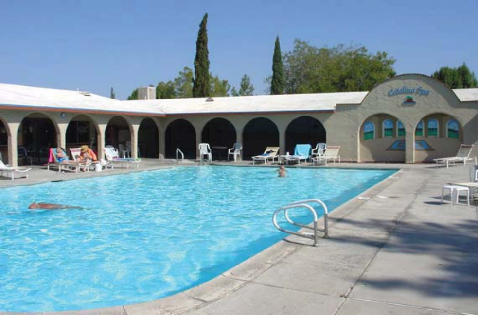
Catalina Spa Lower Pool.