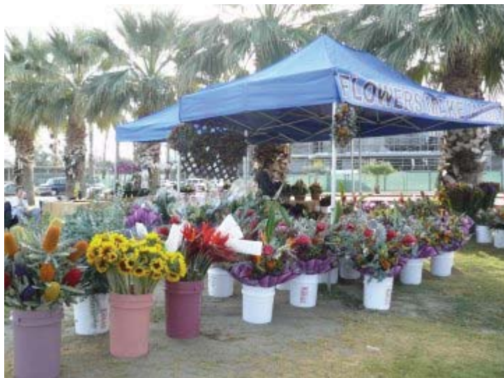
College of the Desert Flower Booth.

Less than an hour's drive from our park takes you up in the mountains and into Yucca Valley . From there it's a short drive to Pioneertown which is an old Western movie set. It's a fun car drive and even more fun on a motorcycle. There is a large biker bar with cold beer and really great hamburgers so arriving around noon works well.