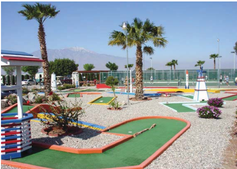
Catalina Spa Miniature Golf and Pickleball Courts.

The big RV show, i.e., Quartzsite, Arizona, starts on Saturday, January 16 and runs through Sunday, January 24 . We won't take the motorhome this year, but we will drive over with our friend, Mel , for a day on Tuesday January 19 . We expect to leave Desert Hot Springs between 6 and 7 a.m. and return long after dark. There is a darn good chance that we will be having an early dinner at Silly Al's Pizza , 175 W. Main Street in Quartzsite at 4 p.m. The food at Silly Al's is quite good and the place gets packed during the RV show. You will have a long wait if you show up after 4. If you're at Quartzsite, we'd love to see you at Silly Al's. Come and have a beer and some good Italian food. Hope to see you there!