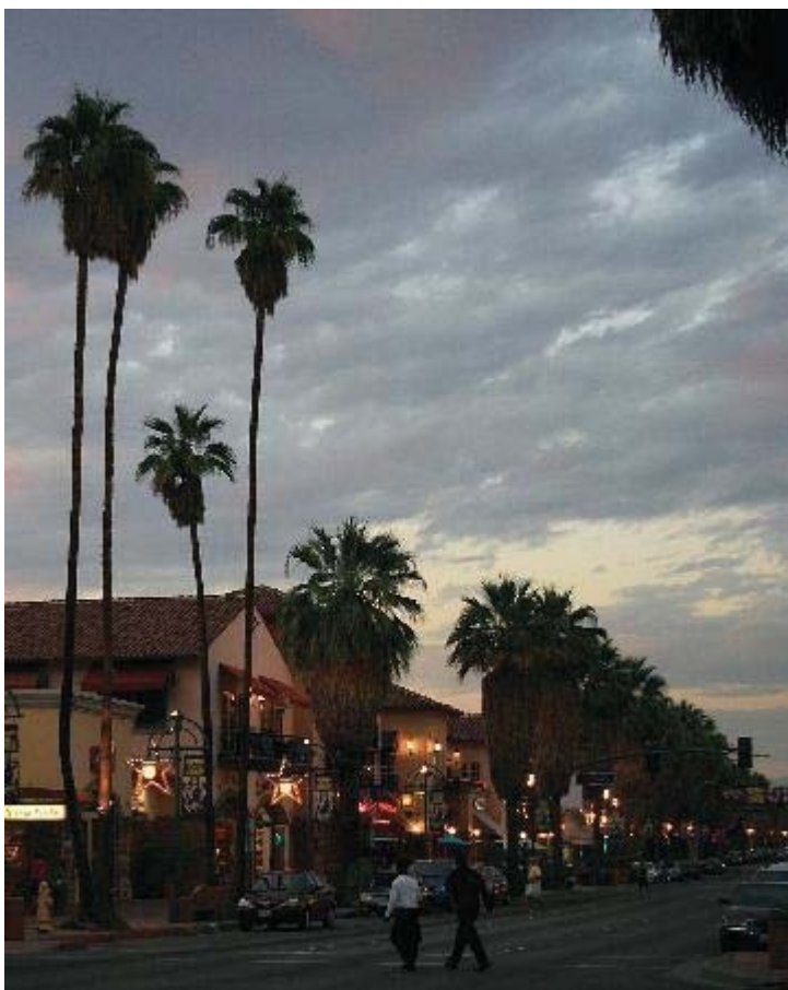
Evening in Palm Springs.

Palm Springs in the evening is particularly pleasant. Warm, balmy nights, colorful atmosphere and lots of interesting shops and restaurants. Every Thursday night at 6 p.m. they close the main street to automobiles and there is about a half mile of street vendors. It is just plain fun.