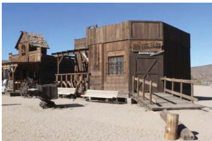
A small portion of Pioneertown.

Less than an hour's drive from our park takes you up in the mountains and into Yucca Valley . From there it's a short drive to Pioneertown which is an old Western movie set. It's a fun car drive and even more fun on a motorcycle. There is a large biker bar with cold beer and really great hamburgers so arriving around noon works well.