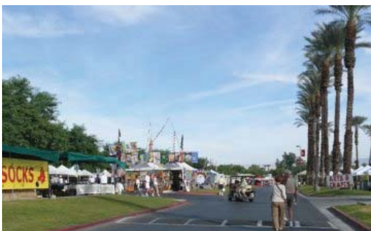
Entrance to College of the Desert Street Fair.

College of the Desert on Saturday and Sunday mornings also has a free and interesting group of vendors. Food, music, art, and everything else you can think of at reasonable prices.