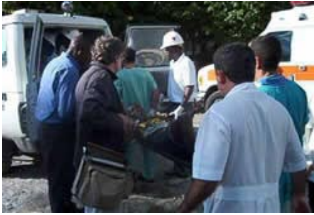
Cuban doctors evacuate the wounded during disturbances in early 2004.

were deployed in the most remote areas, or in the epicenter of the emergencies: the city of Gonaives, where Haiti's independence was first declared. Despite their own precarious situation, and despite offers to return home, all of the physicians decided to stay through rebellion and even occupation.