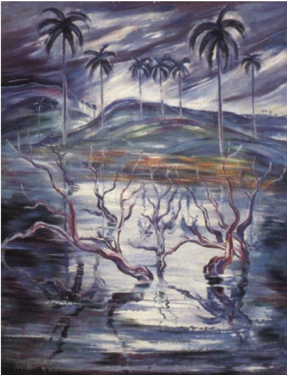
PAISAJE EN RIVO, CARLOS ENRIQUEZ, 1943