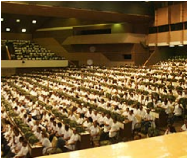
Waiting for Washington: Cuban medical team assembled in Havana.

for such a disaster, the backpacks contained re-hydration therapies, insulin, hypertension medications, treatments for systemic and topical infections, and minor surgical instruments, among others. With their packs on their backs and an average of 10 years clinical experience, these physicians were prepared to provide an experienced, mobile team able to move where health care was most needed. This flexibility would be enhanced by diagnostic kits carried by the doctors working alone or in pairs, for on-site patient evaluation in either English or Spanish.