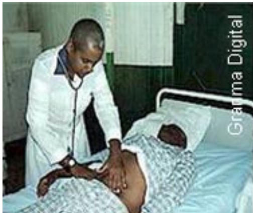
Despite challenges, Cuban doctors and medical specialists continue their work in Haiti

working side by side with 25 Cuban medical personnel. In the poor district of Raboteau there are 15 Cubans taking care of the sick and injured, whereas the rest of the Cuban team is in several areas where the homeless are concentrated.