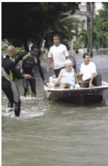
Evacuations from flooded areas of the Vedado neighborhood were carried out by specialist teams in small boats.

In a country heavily dependent on revenue from foreign visitors, evacuation of tourists - during Wilma, over 1,000 were moved inland from seaside hotels and resorts - is also a major component of Cuba's disaster preparedness plan. MEDICC Review staff witnessed evacuation from one