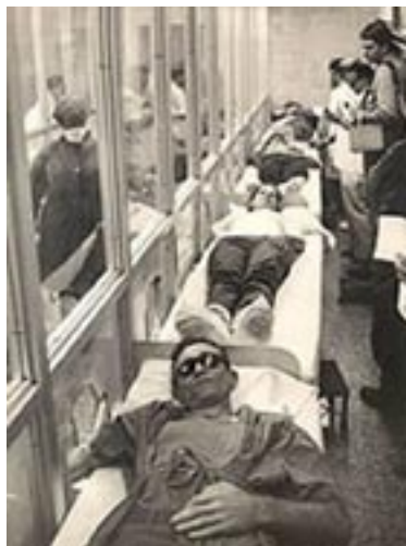
Cuban volunteers at a Havana blood bank alter the earthquake in Peru, 1970.

Most often over the years, Cuba has sent disaster relief in the form of medical brigades, as shown in the chart below. Sometimes the aid has gone to countries with which Cuba’s government had no diplomatic relations. And frequently, the teams have found themselves among the first to arrive, before the disaster itself has subsided. Cuban doctors still talk about their hands trembling from the after-shocks as they treated the wounded in Nicaragua’s 1972 earthquake. And they have also found their rush to assistance has made for strange allies: two