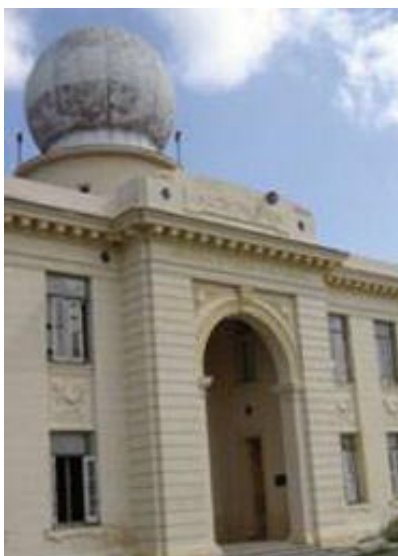
The Cuban Meteorological Observatory in Casablanca, across Havana Harbor.

Other steps that are de rigueur in Cuban hurricane preparedness include detailed instructions in print and broadcast media on how to secure your home and the safest place to be during a hurricane; accelerated harvesting to ensure foodstuffs; safeguarding and securing schools, clinics and hospitals; the preparation of short-cycle crops to be planted during the recovery phase; and clearing trees near telephone and electrical wires. In addition, when winds reach a certain velocity, the electric company simply cuts the power – saving countless lives that