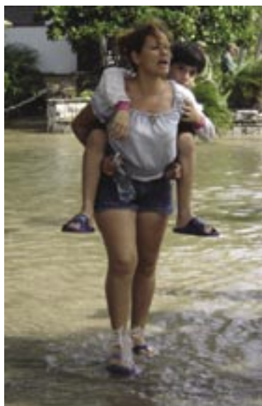
A mother and daughter move to higher ground in Havana's Vedado district during Hurricane Wilma.

Many said despite warnings, they were caught by surprise since flooding like this hadn't been seen in Havana since the 1993 "Storm of the Century." A resident of 5 th and E Streets in Vedado was frantically moving his valuables to his neighbor's house on the second floor when a boat came to evacuate him with his wife. "The water came up so fast as we were stowing our things with our neighbor," he told MEDICC Review shortly after wading to dry ground. "Our three kids are already at a friend's house, and that's where we're headed now. We'll go back and see the damage when the water recedes," he said.