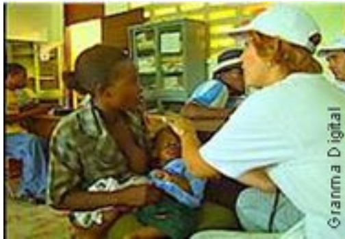
Two of over 45,000 Haitian patients attended by Cuban medical staff in the wake of Tropical Storm Jeanne

The Norwegian Red Cross has set up a field hospital where two Norwegian doctors and three Canadian doctors are