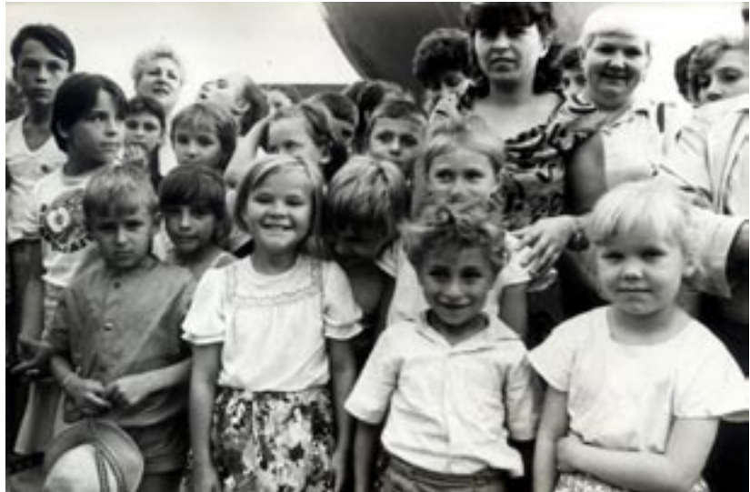
Victims of the Chernobyl explosion first arrived for treatment in Cuba in 1990.

On April 26, 1986, the central reactor at the nuclear plant in Chernobyl, Ukraine exploded and caught fire, killing dozens and inciting panic as plumes of radioactive smoke spread outward; the toxic fallout eventually killed thousands. Children were among the first to be evacuated in a massive exodus that saw 150,000 people abandoning their homes and workplaces; everything for a 30-km radius from the reactor was left behind