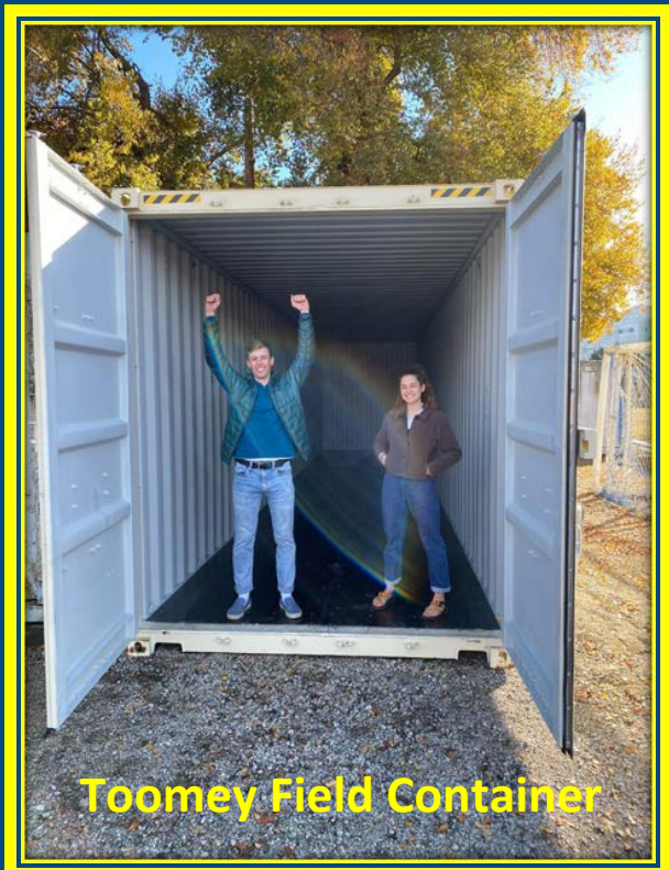
Toomey Field Container