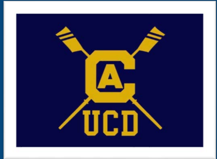
Old Jersey Logo