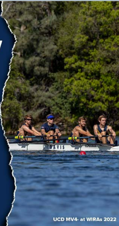
UCD MV4- at WIRAs 2022