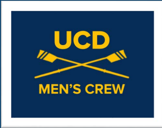
New Jersey Logo