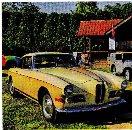
1959 503 presented by BMW Classic.