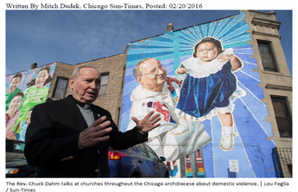
Photo 2. Context 2: Parish leadership bold stance against intimate partner violence and abuse.

Pilsen priest crisscrosses archdiocese to talk about domestic violence