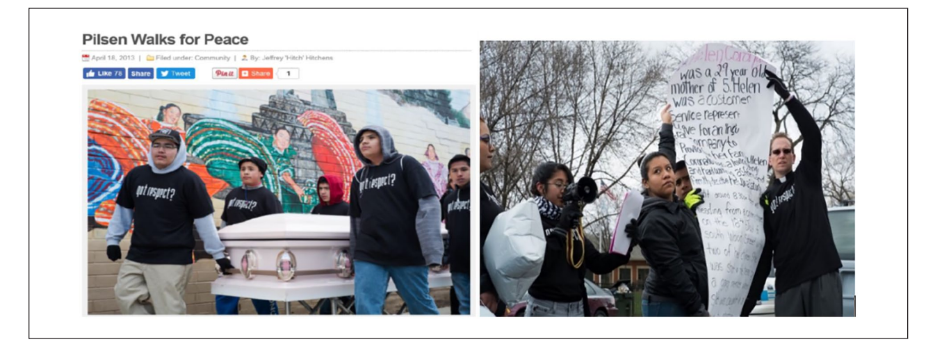
Photo I. Context I: Photo evidence of strong community and parish relationship. Permissions for reprint obtained.

Observational data, reflective memos, and transcripts from archived video data indicate that his homilies/sermons on the topic of IPV/A were straightforward, research-based, and engaging, but also compassionate. The homilies invite people who have perpetrated or experienced violence and abuse to seek help. Indeed, two of the focus group participants cited the reason they sought help from TMG from hearing a sermon on DV that was given by "a St. Pius V priest". As one participant stated