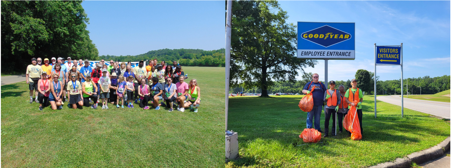
June 18, 2023 21st Annual "Run for Justice" at Angler's Park