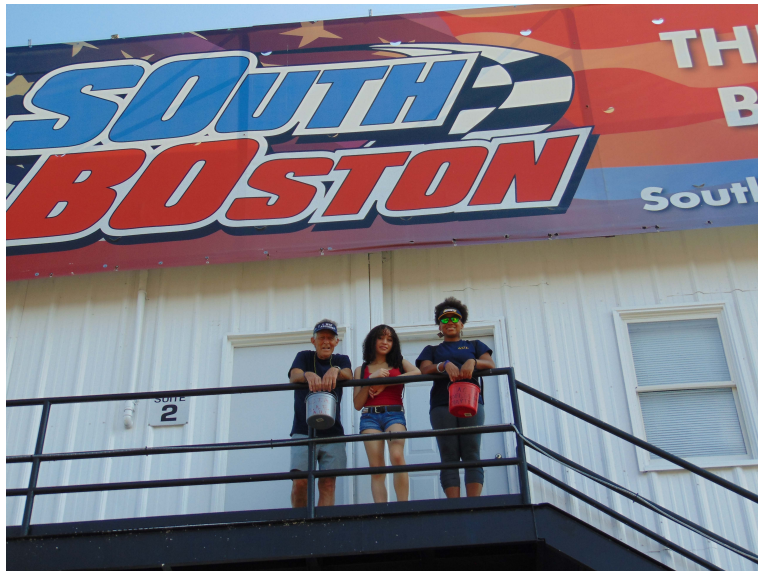
"50-50" August 2023 Fundraiser at South Boston Speedway