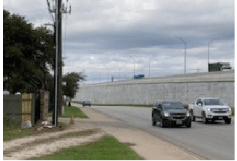
View of public thoroughfare from subject property.