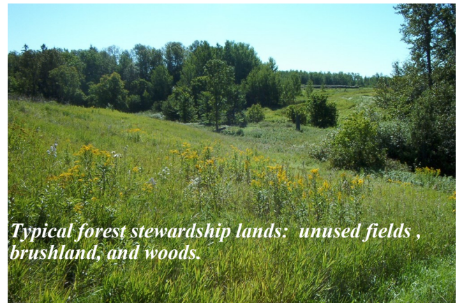
Typical forest stewardship lands: unused fields, brushland, and woods.

None. And you keep control of what's done and who has access. If you enroll in tax reduction, annual payment or pursue further assistance beyond your stewardship plan there may be requirements to meet.